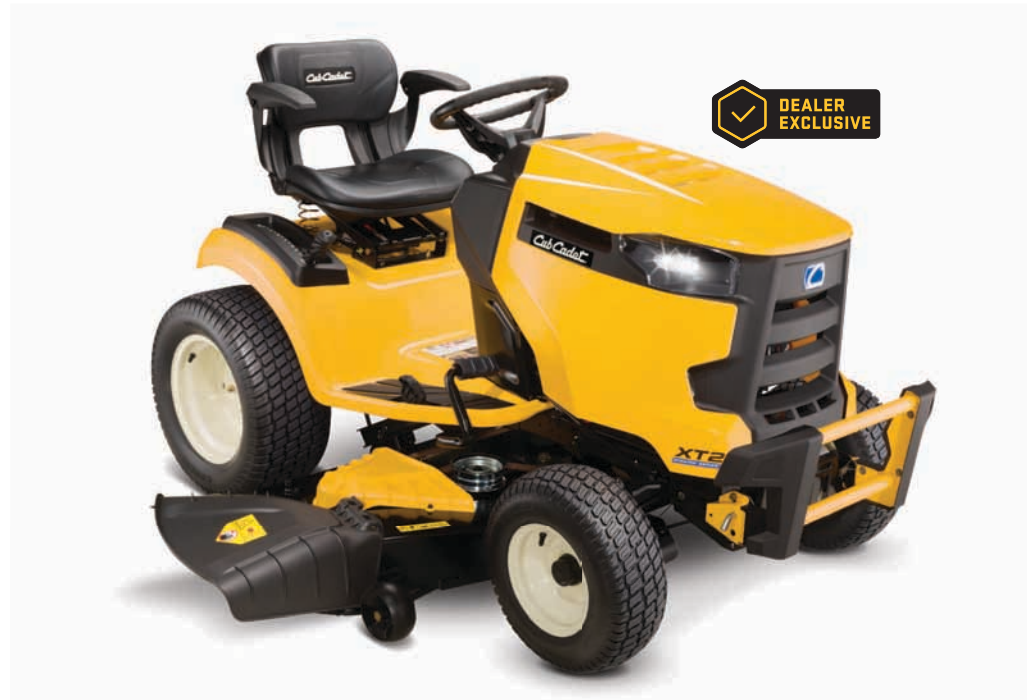
XT2. ENDURO SERIES™