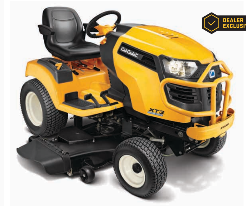
XT3. ENDURO SERIES™