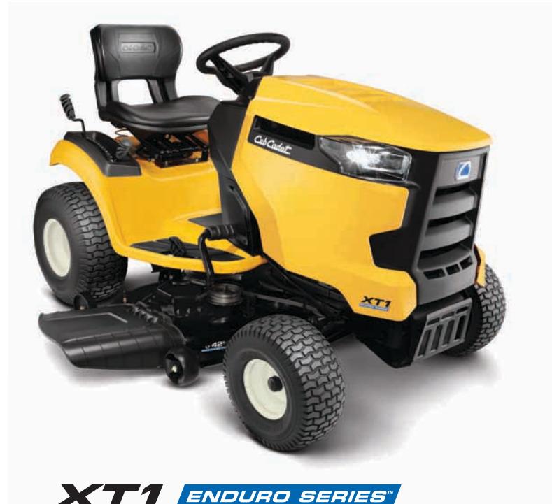
XT1. ENDURO SERIES™