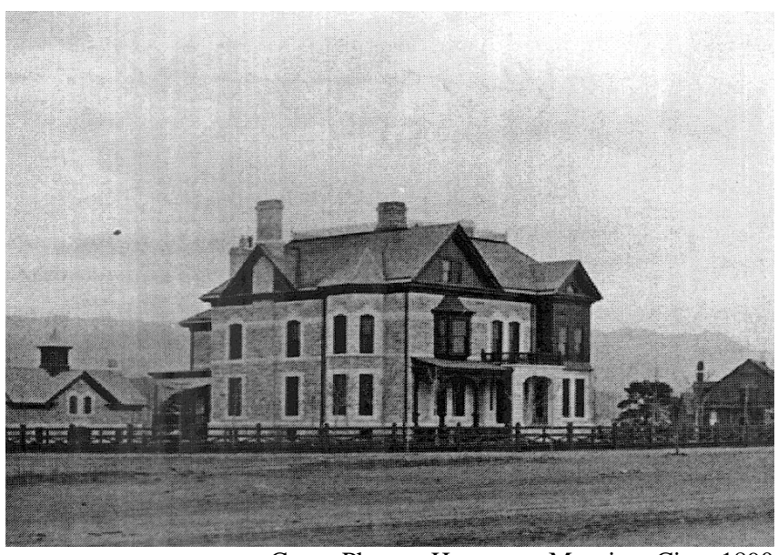
Cover Photo – Hagerman Mansion, Circa 1890