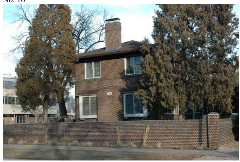
Birdsall Residence 731 North Cascade Avenue Built 1911 / Architect Unknown No. 16

This two-story, brown brick house is representative of the large, architecturally distinguished houses erected along North Cascade during the early 20<sup>th</sup> century. Constructed in 1911 and considered Italian Renaissance in style, it features an asymmetrical façade with arched central bay and a stepped back entrance on the north. Two coal chutes still exist on the north wall, along with what appears to be an incinerator door.