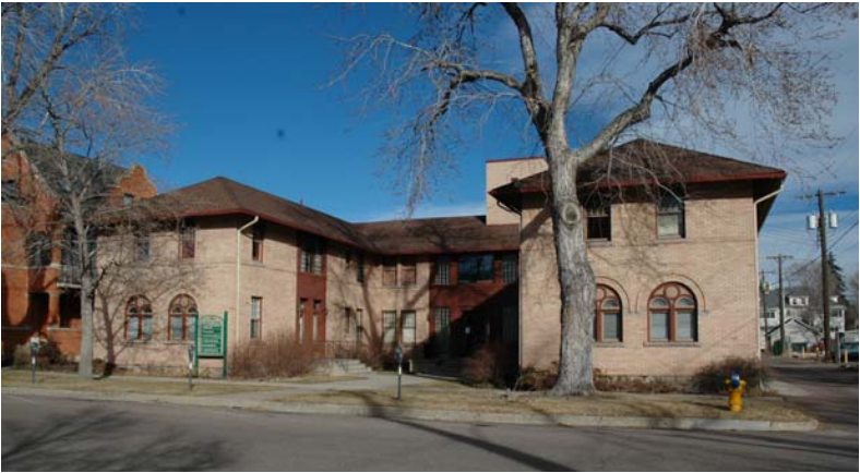
St. Vrain Court Apartments 104-108 East St. Vrain Street Built 1900 / Architect Thomas P. Barber No. 38

This building is a good example of an early apartment building. The trend toward these early tenements (as they were called at the time) alarmed some residents of established neighborhoods, who worried about privacy and appearance. They eventually gained acceptance due to their design, affordability and convenience.