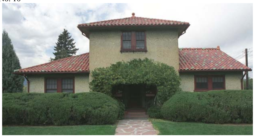
Jones-Will Residence 620 Park Terrace Built 1927 / Architect Unknown No. 10

The Mediterranean flair exhibited by this house is accentuated by the central entrance tower and the tile roof. It is noteworthy for its widely overhanging eaves, stucco walls, wrought iron details and multi-light windows with balconets. It appears to have had few alterations since its original construction.