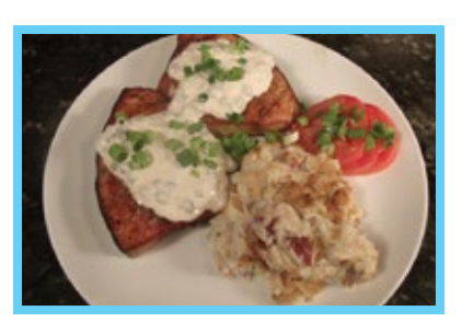
GRILLED SWORDFISH ZIPPY LEMON CAPER SAUCE