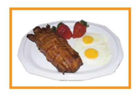
FATTIE (WARNING! HAZARDOUS TO YOUR GIRTH!)