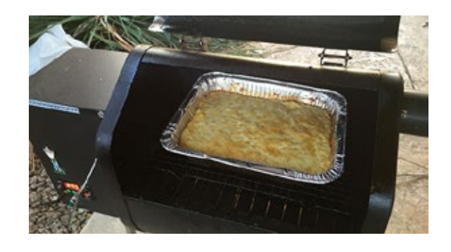
Yep its that easy. Enjoy!