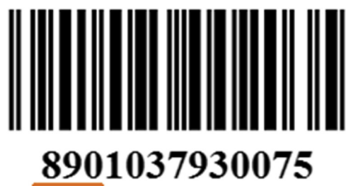
Fig. 1. 13-digit GS1 India code.

As shown in Fig. 2, APEDA and GS1 India have together initiated