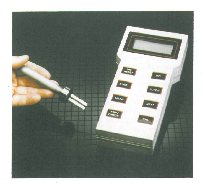
Plate I Frying Oil Quality Meter

As the original Rau test was developed in response to German legislation in which it is not permissible to use frying oils containing more than 24% polymerised and oxidised material, the test is good at recognising degraded oils. It may not be so good if earlier rejection points are specified in some establishments. Its efficiency is also reported to vary quite considerably depending on the nature of the frying medium, e.g. solid oil (palm), liquid oil, or tallow<sup>31</sup>, especially if a colour that develops naturally