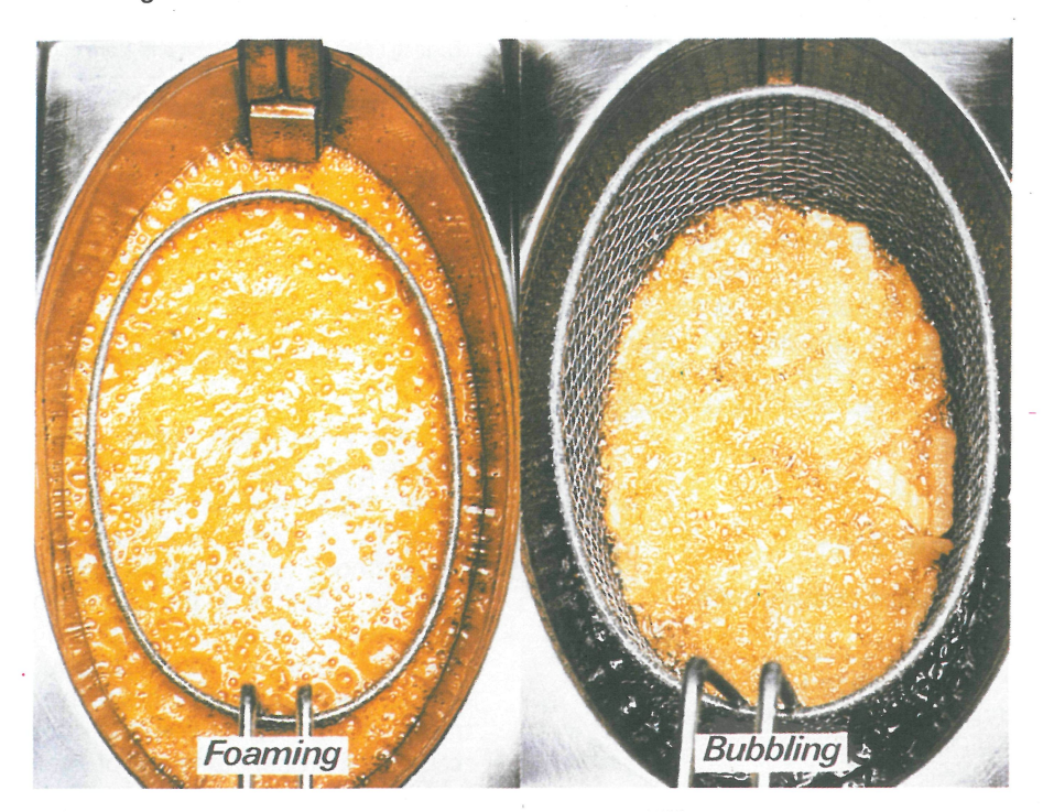
Figure 1 Comparison of foaming and bubbling oil in the frying of potato chips

From Blumenthal, Stockler & Summers<sup>22</sup>