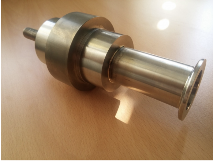
Figure 3: Showing a shape-memory actuator for the Ultra High Vacuum chambers of the HL-LHC. [33]

which it is a larger ring shape) and then heated, causing it to contract around the vacuum chamber. This will be easier to install and remove than existing technology [33].