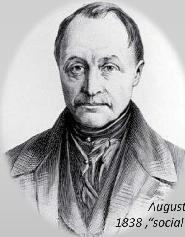
Auguste Comte 1838, “social physics”