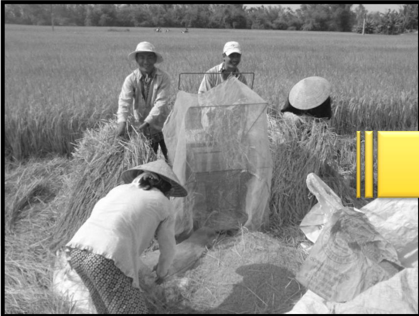
Primitive agriculture (Small farm)