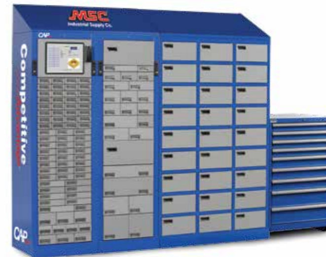
One Touchscreen Interface Can Control Multiple "Add-On" Units