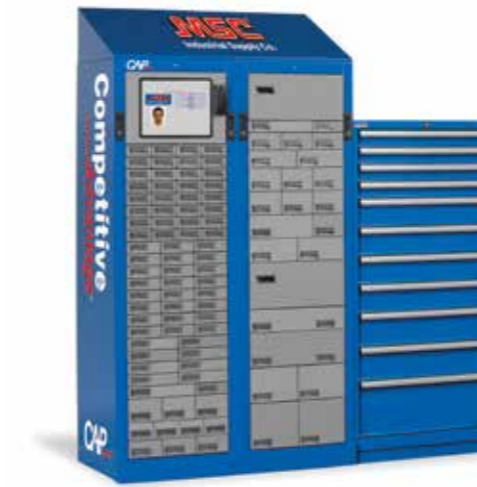
Towers and Modified Cabinets

Combine the vending solutions that best accommodate your tooling.