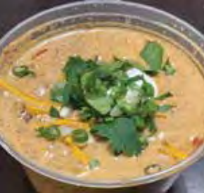
Queso Taco Soup