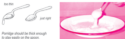
Figure 2: Consistency of Complementary food