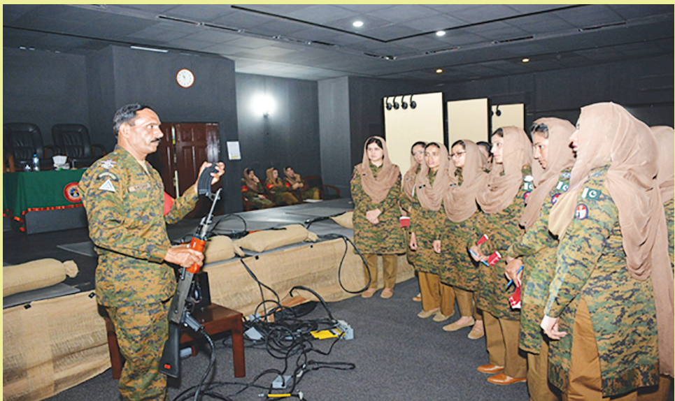
Figure 12 - Training at MEGGITT Weapon Simulator