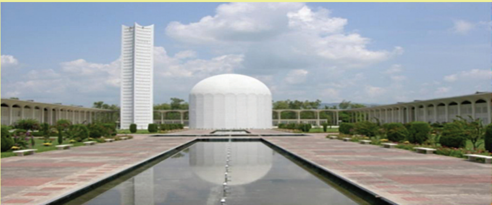
Figure 2 - Pakistan Institute of Nuclear Science and Technology (PINSTECH)