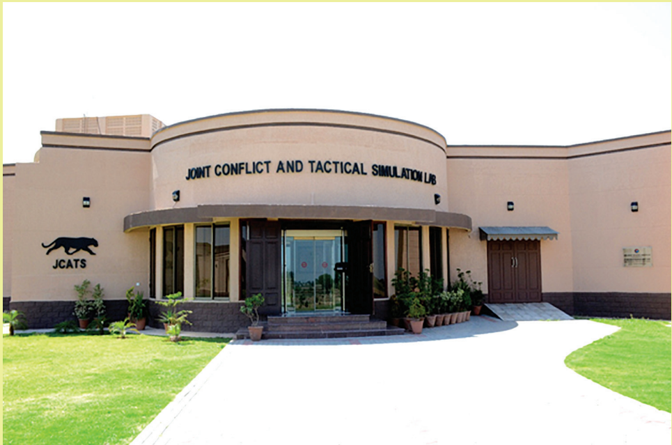
Figure 11 - Joint Conflict and Tactical Simulation Laboratory – PCENS