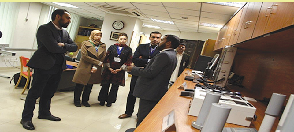
Figure 7 – Training course on Sustainability of Radiation Detection Equipment and expert support capabilities at PNRA