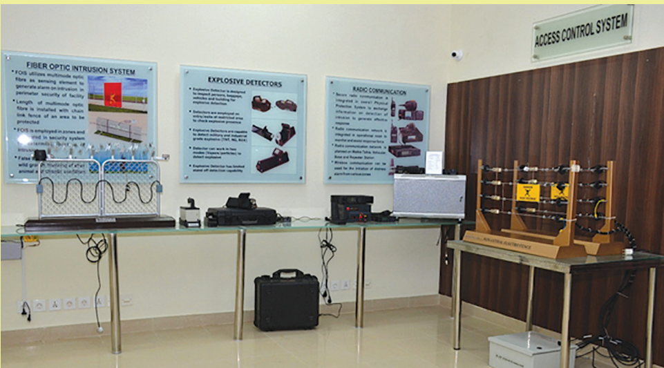
Figure 10 - Physical Protection Systems Laboratory – PCENS