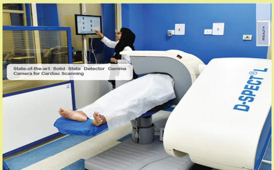
Figure 4 – Operation of Gamma Camera for Cardiac Scanning