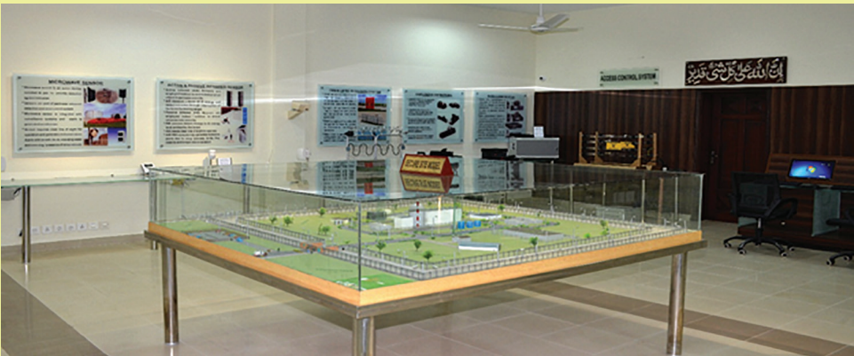
Figure 9- Physical Protection Systems Laboratory – PCENS