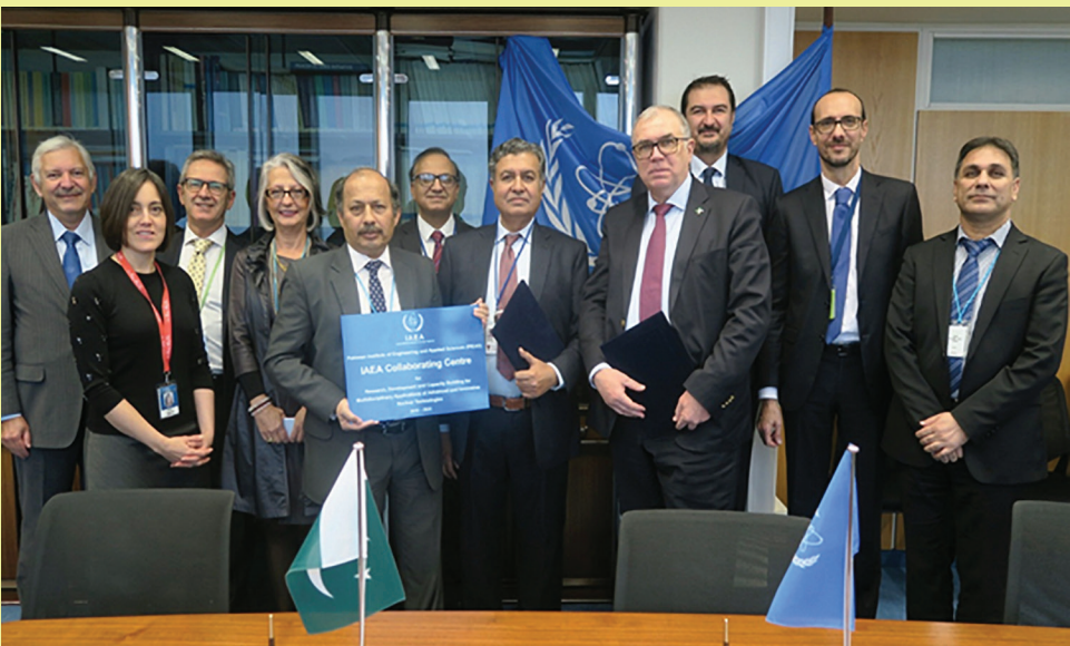
Figure 15 - Ceremony for PIEAS as IAEA Collaborating Centre for assistance in nuclear technologies