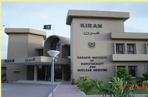
Figure 3 – Nuclear Medical Centre at Karachi