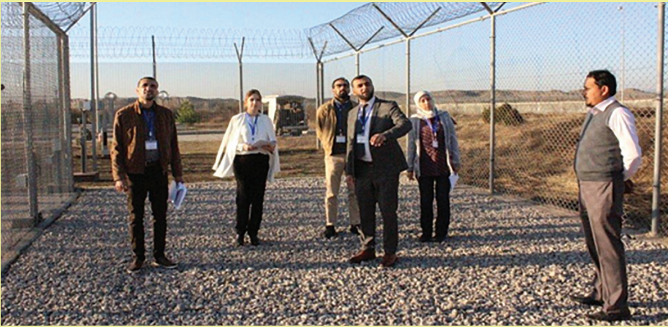
Figure 5: Training at Physical Protection Exterior Laboratory