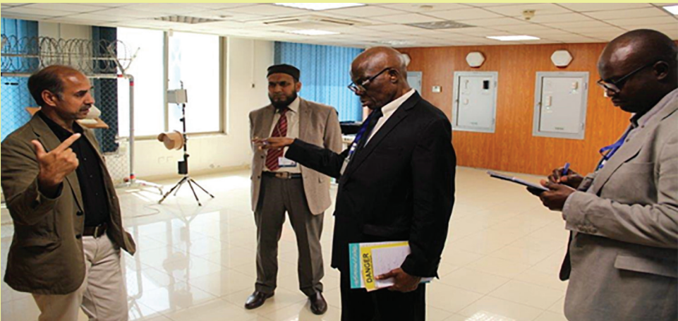
Figure 6 – Nigerian delegation visit to Physical Protection Interior Laboratory (PEEL) at PNRA