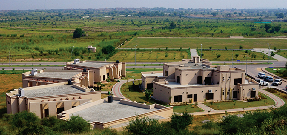
Figure 8 - Pakistan Centre for Nuclear Security (PCENS)