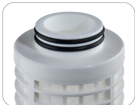
BX - Quick-fit configuration with 45 mm double o-ring end-cap.