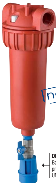
DRAIN FUNNEL Back-flow preventing device UNI EN 1717-11/2002

IN/OUT connections 1/2", 3/4", 1", with plastic BSP threads; models with NPT plastic threads 3/4", 1".