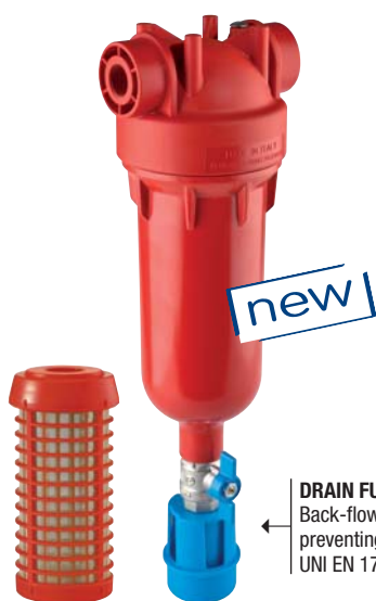
DRAIN FUNNEL Back-flow preventing device UNI EN 1717-11/2002