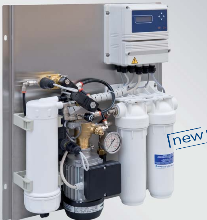
RO 050.DGT Permeate production 50 l/h

RO units and plants designed on specific demand up to 50000 l/h. Models applicable for brackish water. Single stage RO units and dual stage RO units for bi-desalination for technological use, designed for use in several industrial sectors: pharmaceuticals, cosmetics, electronics, and all other use requiring ultra-pure water. A wide range of components from prime manufacturers to achieve the highest standards combined with specific proprietary solutions to improve technology and liability.