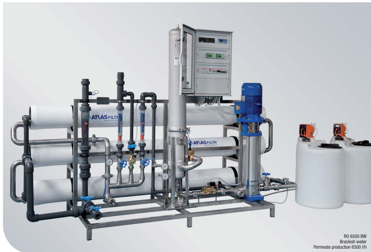
RO 6500 BW Brackish water Permeate production 6500 l/h