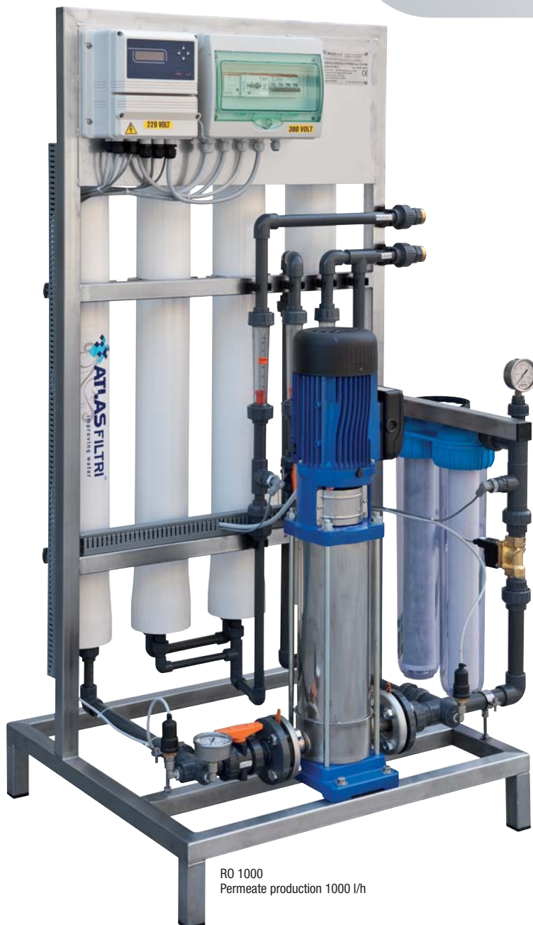
RO 1000 Permeate production 1000 l/h