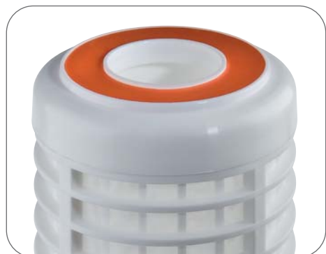
SX - Standard double open end (DOE) configuration with flat seals.

Accessories on demand: Filter-Fit special centering device for SX cartridges applicable for DP housings; containing sponge.