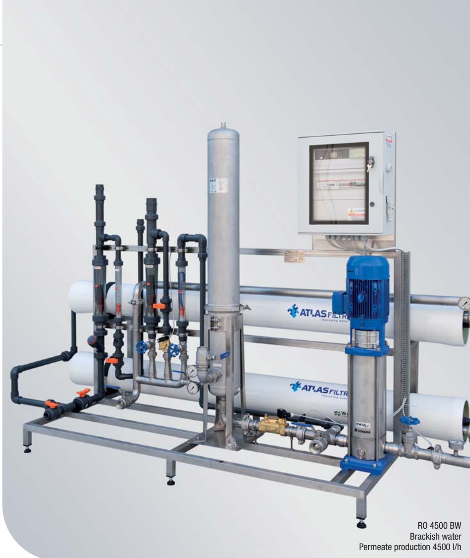
RO 4500 BW Brackish water Permeate production 4500 l/h