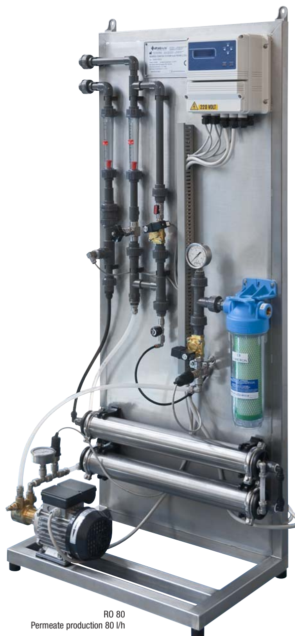
RO 80 Permeate production 80 l/h