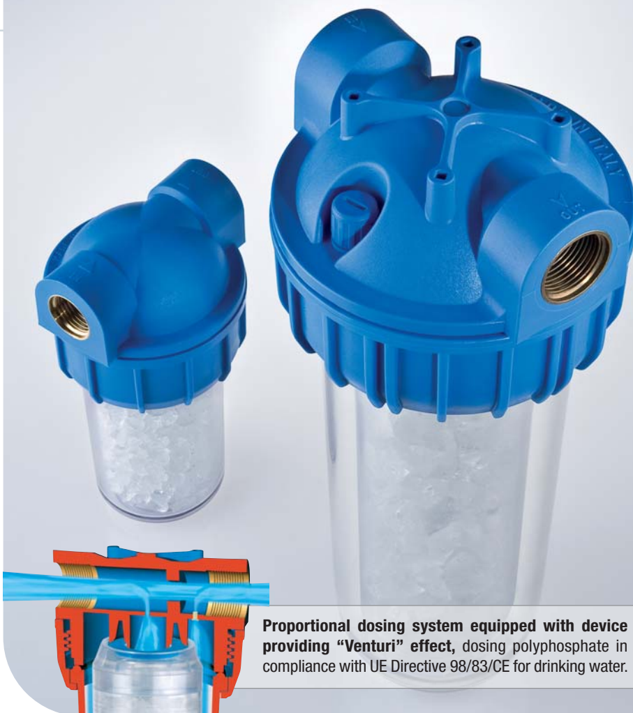
Proportional dosing system equipped with device providing "Venturi" effect, dosing polyphosphate in compliance with UE Directive 98/83/CE for drinking water.

Main materials: Reinforced PP, PET, SAN (only Mignon type).