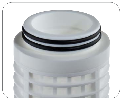
CX - Quick-fit configuration with 57 mm double o-ring end-cap.