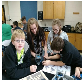
The 4-H After-School Robotics Club in Iosco County received a $1,000 Michigan 4-H Legacy Grant to use VEX Robotics as a tool

Learn more or apply online at http://mi4hfdtn.org/grants . Questions? Contact the Michigan 4-H Foundation at 517-353-6692.