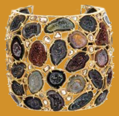
Kimberly McDonald, One-of-a-Kind Signature Geode Cuff set in 18 kt. Yellow Gold with Brown Rose Cut Diamonds.

Initiatives in Art and Culture takes a wide-ranging look at gold in its sixth conference devoted to this extraordinary metal.