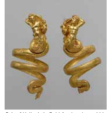
Pair of Hellenistic Gold Armbands, ca. 200 B.C. The Metropolitan Museum of Art, Rogers Fund, 1956, 56.11.5, .6.