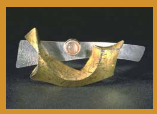
Charles Lewton-Brain, Pin, Swoop Series, moonstone, 24 kt., 18 kt. doublée, sterling, scored and bent.