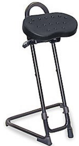
Grainger Sit Stand Stool