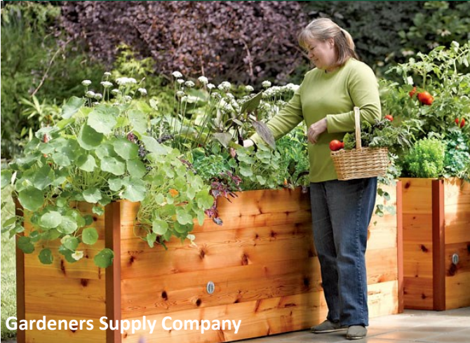
Gardeners Supply Company