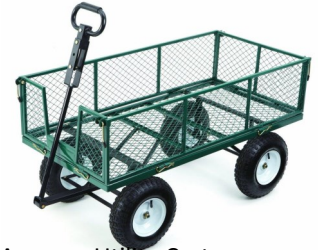
Amazon Utility Cart

Utility carts eliminate placing items on the floor and the need to transport heavy items by carrying