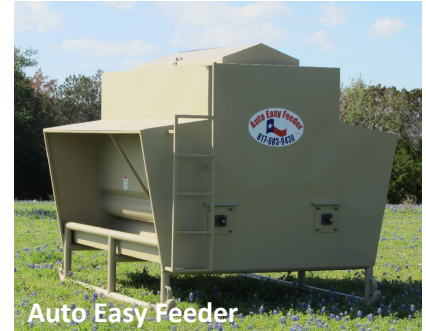
Auto Easy Feeder

Automatic feeders make feeding live-stock easier and decrease the need for repetitive bending, lifting, and twisting.