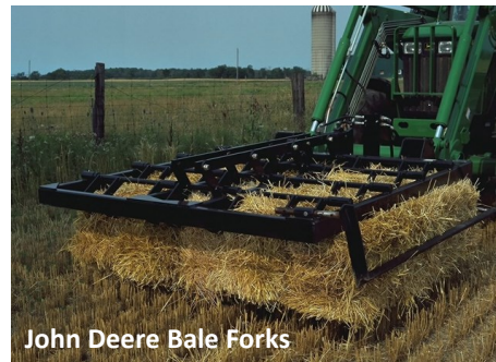
John Deere Bale Forks

Square hay bale forks allow a producer to pick up 8 to 10 square bales simultaneously. Thus reducing, time, stress, and strain on joints and back