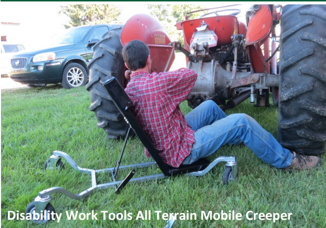
Disability Work Tools All Terrain Mobile Creeper