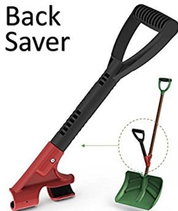
Stout Backsaver Grip Attachment

Extra handles on long handled tools decreases the amount of bending required to do a task on the farm/ranch. It also allows the producer to stay upright while using the tool