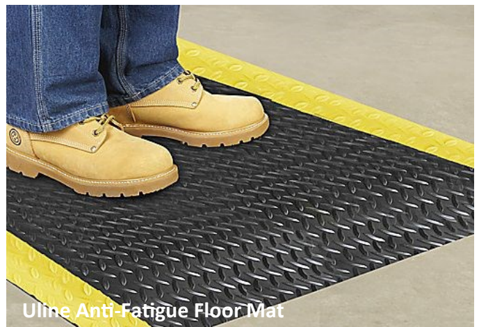
Uline Anti-Fatigue Floor Mat