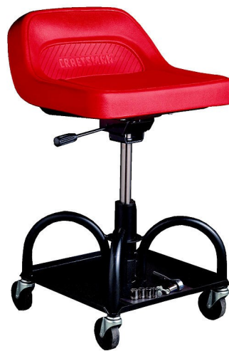
Craftsman Adjustable Work Stool