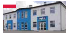
Bedzin (Katowice), Poland