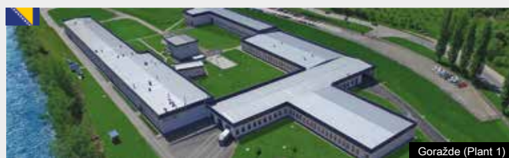
Goražde (Plant 1)