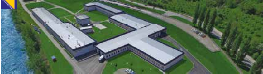
Goražde (Plant 1), Bosnia-Herzegovina