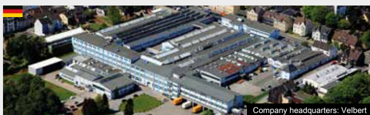
Company headquarters: Velbert