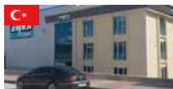
Çerkesli-Dilovşı (Istanbul), Turkey