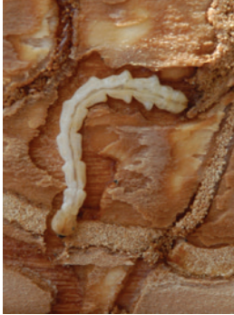
EAB larvae damage the vascular system of the tree as they feed, which interferes with movement of systemic insecticides in the tree.

greater than 15 inches at a rate that is twice as high (2× rate) as the rate used for smaller trees (1× rate). In an OSU study in Toledo conducted from 2006–2014, imidacloprid soil drenches effectively protected ash trees ranging from 15–22 inches in diameter when applied at the 1× rate in spring, or at the 2× rate when applied in either the spring or fall. These treatments were effective even during years of peak pest pressure when all of the untreated trees died. Trees treated in fall with the 1× rate, however, declined and had to be removed.