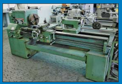
Large Quantity Well Maintained Toolroom Machinerv