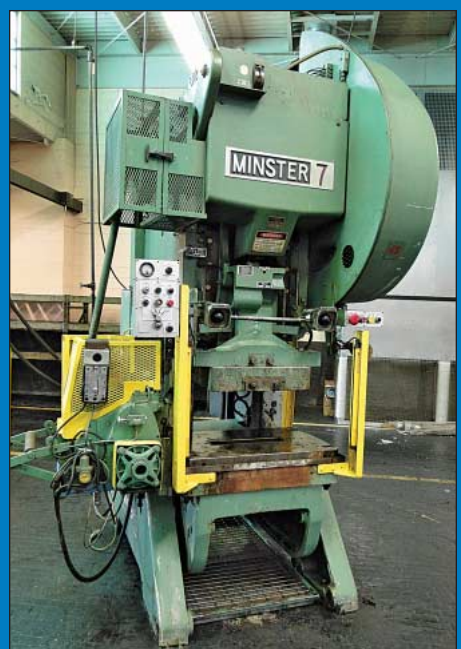
75 Ton Minster 101-7-75 Flywheel OBI Press

75 Ton Bliss OBI Press; S/N 28655, 32" X 24" Bed, 6" Stroke, 18.5" SH, 3" Adj, 45 SPM, 10 Ton Cushion, Air Clutch