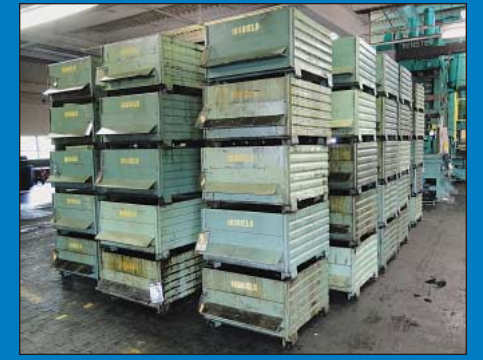
(113) 41" X 32.5" X 21" Green Steel Parts Bins

Office Equipment Consisting of; Toshiba DP2520 Copier,<br/>Calcomp 1043 Pin Plotter, Calcomp CCL 600 XL Printer,<br/>Drafting Table, (2) 3-Drawer Lateral Files, Steel and Wood DPBinsDesks, Office Chairs, Conference Room Table and Chairs, (2)SEE PHOTO4-Drawer Hercules Fire Proof Legal Files and Other Items