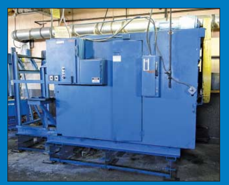
Globe Model Lo-APMR Electric Fired Tumbling Drum Parts Washer

(113) 41" X 32.5" X 21" Green Steel Parts Bins SEE PHOTO