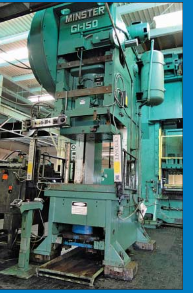
150 Ton Minster G1-150 Gap Press

INSPECTION: Tuesday, Sept. 20th 9:00 AM to 5:00 PM