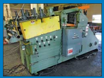
10,000 Lb Press Room Model CS-100 Equip Cradle Straightener