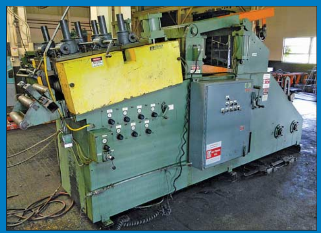
Large Quantity Late Model Feed Equipment Including Straighteners, Servo Feeds, Standard Straighteners and Uncoilers

Featuring: (5) Minster SSDC Presses to 500 Ton and 84" X 48" Bed Area, 150 Ton Minster G1-150 Gap Frame Press w/ 50" X 30" Bed, 6" Stroke, 30 to 60 SPM, 100 Ton Minster P2-100 S.S.D.C. Press w/ 41" X 38" Bed, 4" Stroke, 100 to 200 SPM, (2) 75 Ton Minster Variable Speed OBI Presses, (5) 60 Ton Minster Variable Speed OBI Presses, 60 Ton Minster B1-60 S.S.D.C. Press, (2) 32 Ton Minster OBI Presses, Minster Servo Feed Lines, Dallas, Perfecto & Littell Straighteners & Coil Reels, 10' X 1/4" Cincinnati Shear, Two-Stage Rotary Drum Parts Welder, Complete Toolroom w/ Lathes, Mills, Drills, Saws, Grinders, Etc., Air Compressors, Lift Trucks & Shop Equipment