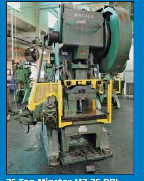
75 Ton Minster M7-75 OBI Press