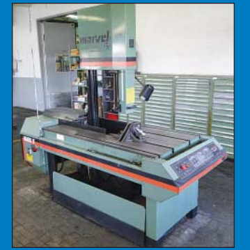
18" Marvel Armstrong Model 8 Mark II Tilt Frame Vertical Band Saw