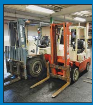
Bank View 9,000 Lb. Nissan Pneumatic Tire and 6,000 Lb. <u>Nissan Solid Tire Lift Trucks</u>