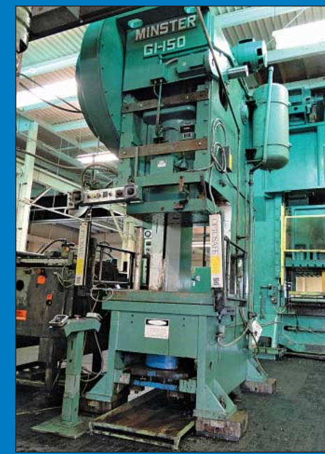
150 Ton Minster G1-150 Gap Press