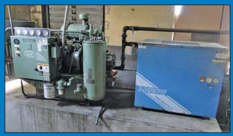
Overall View Air Compressor System