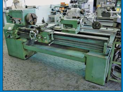
17" X 60" Leblond Regal Geared Head Engine Lathe

Partial View (1 of 10) Littell Uncoilers