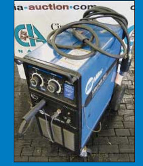
200 Amp Miller Millermatic 250 Mig Welder