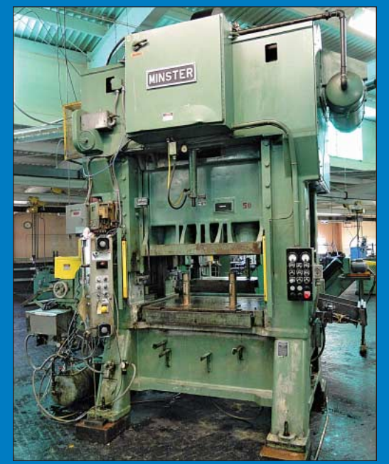
150 Ton Minster S2-150 SSDC Press