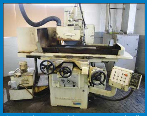
12" X 24" Okamoto Model Accugar-124N Hydraulic Surface Grinder