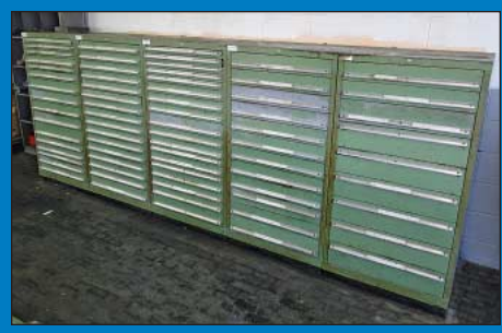
Partial View Numerous Vidmar Tooling Cabinets