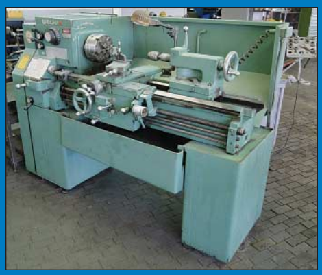
15" X 30" Leblond Regal Geared Head Engine Lathe