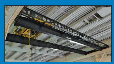
6 Ton X 40' Approx. Span Cleveland Tramrail Double Girder Top Running Overhead Bridge Crane