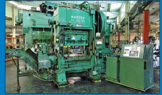
100 Ton Minster P2-100 SSDC Press

Consisting of: (2) 1,000 Lb Litteli #10 Reels, (3) Skids w/ Misc. Bolster Plates, (1) Skid w/ 4"-6"-8" Wide Roller Scrap Guides, (1) Skid w/ 8"-12-14" Wide Roller Scrap Guides, 10" Wide 5-Roll Pull Thru Stock Straightener, (1) Skid w/ T-Bolts And Tabs For Die Hold Downs, (1) Skid w/ C-Clamps, (14) Assorted Steel Platforms From Around The Large Presses And Many Other Related Items