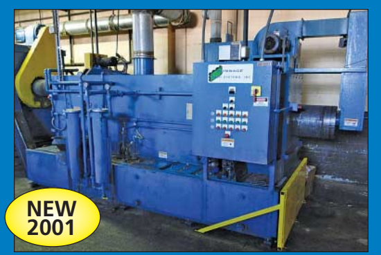
Dunnage Model RTD-15150-CDRB Natural Gas Fired Two-Stage Tumbling Drum Parts Washer