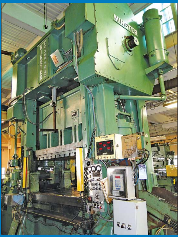
300 Ton Minster E2-300 SSDC Press

No Last Minute Registrations will be accepted. Make Sure to Register & Post Your Deposit No Later than 48-Hours Prior to the Start of the Auction.