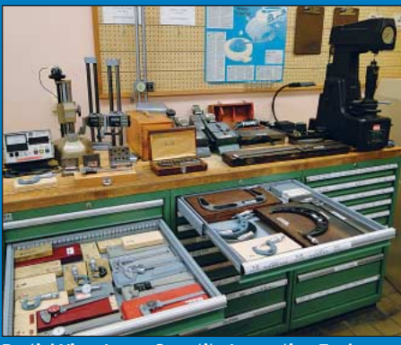
Partial View Large Quantity Inspection Tools