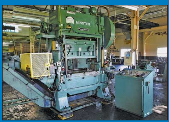
60 Ton Minster P2-60 SSDC Press