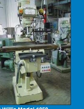
3 HP Willis Model 1050 Microcut Variable Speed Vertical Milling Machine