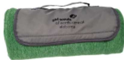
Heather Green Fleece Blanket - $20.00 Measures 51" x 62" when unfolded.