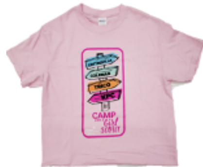
T-shirt – $7.50 or 2 for $14.00 size YS-3X