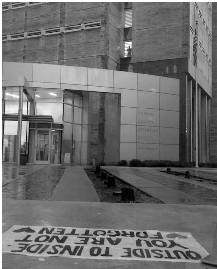
Even a hurricane didn't stop the protests.