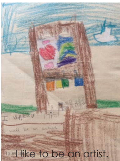
I like to be an artist.