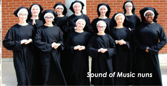
Sound of Music nuns