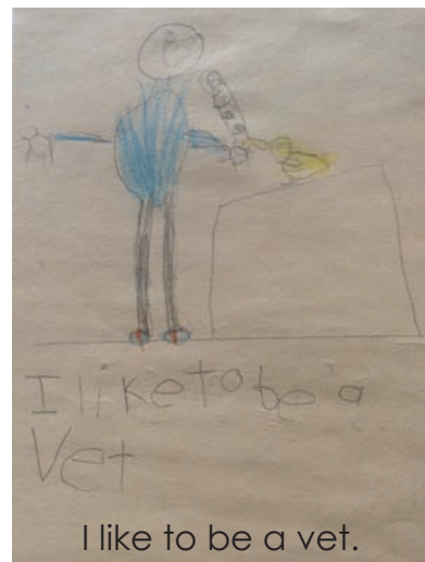
I like to be a vet.