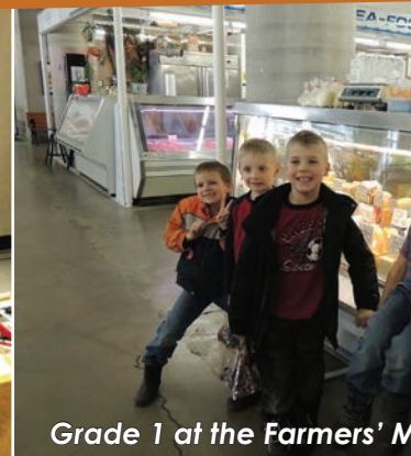
Grade 1 at the Farmers' M