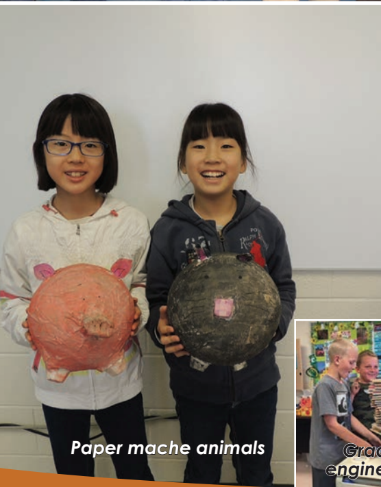
Paper mache animals