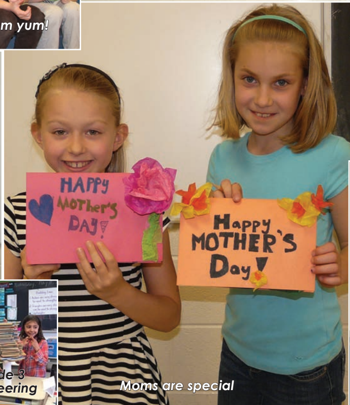
Moms are special