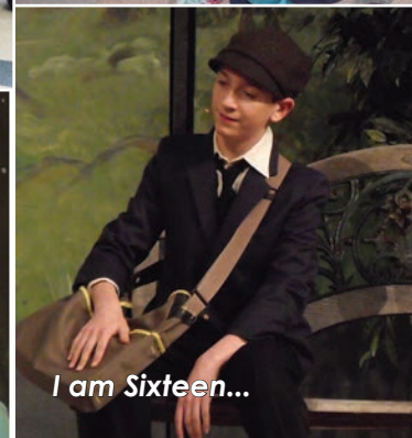
I am Sixteen...