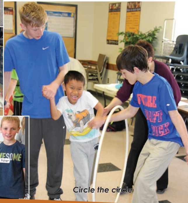
Circle the circle