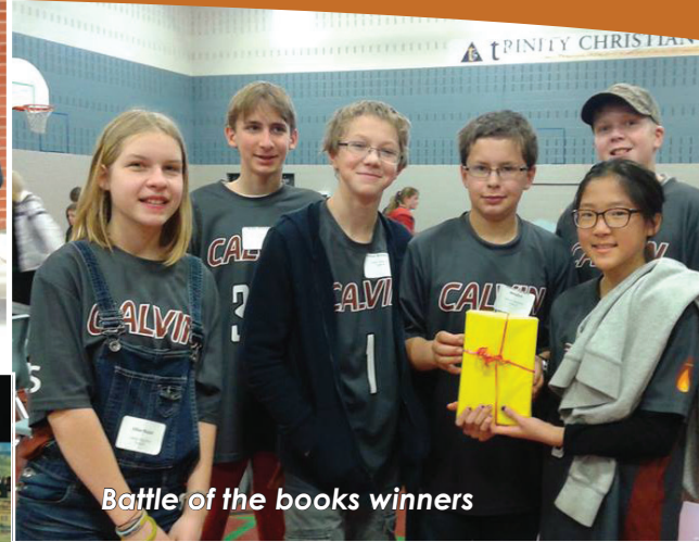
Battle of the books winners