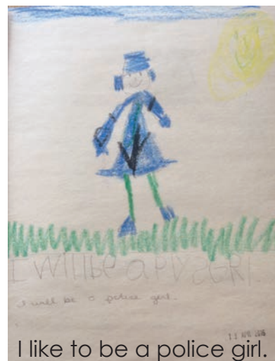
I like to be a police girl.