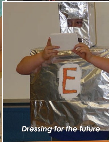
Dressing for the future