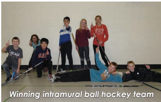
Winning intramural ball hockey team