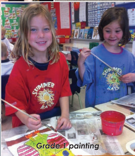
Grade 1 painting