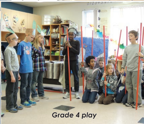
Grade 4 play