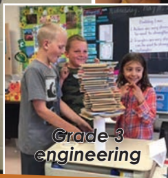
Grade 3 engineering