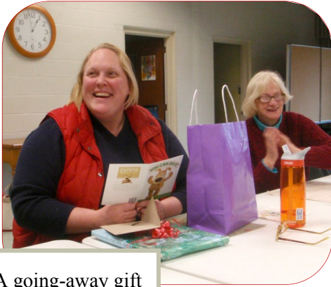
A going-away gift from Women's Fellowship.