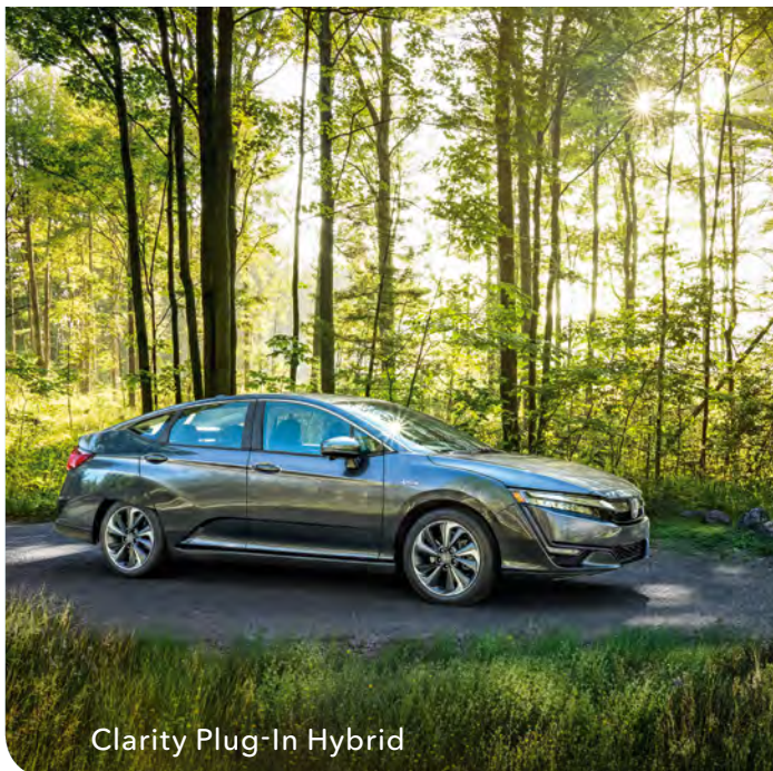
Clarity Plug-In Hybrid