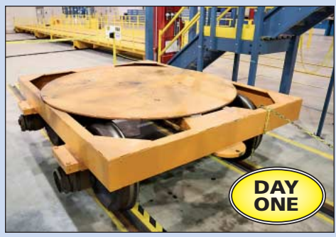
(32) 80" x 98" Manual Rail Car Dollys, 30" Platform Height from Ground