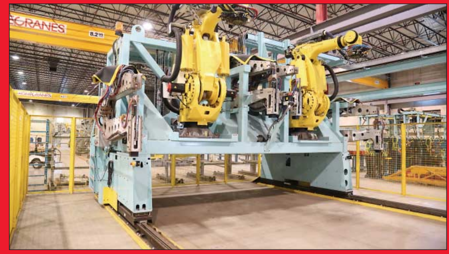
Genesis / Fanuc Track-Traveling Two-Robot Spot Welding System