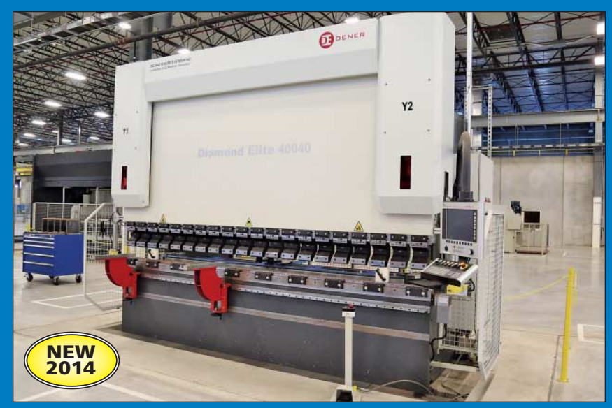
440 Ton X 159" Dener Model DE400-40-AC-ZL-2M Multi-Axis CNC Press Brake