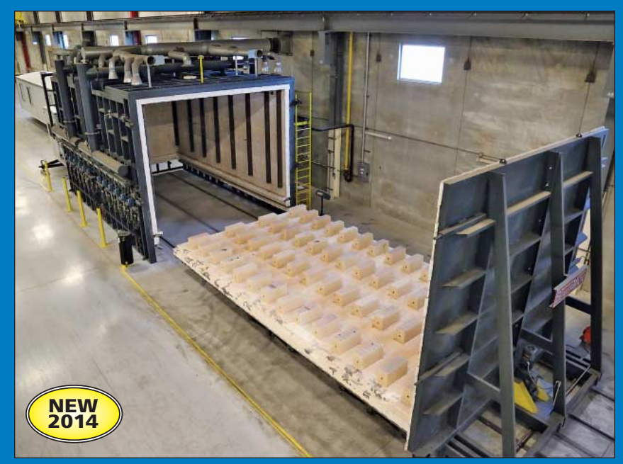
BeaverMatic Model GCBF Stress Relieving Car Bottom Annealing Furnace