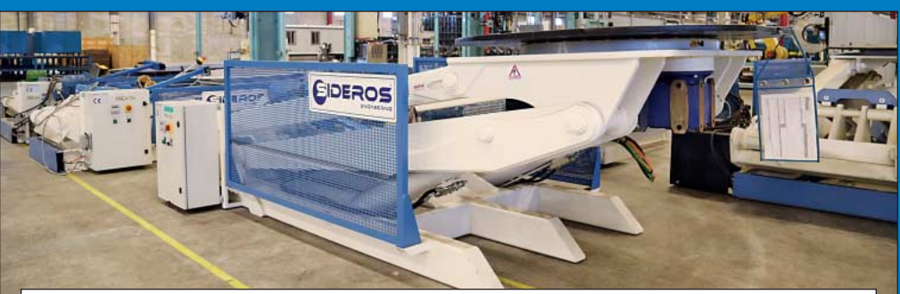
(6) Sideros RL Series 3-Axis Welding Positioners to 18,730 Lb. Cap.

Trackmobile Model 9TM Rail Car Mover; s/n NSA13