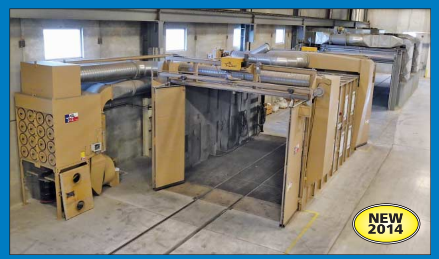
ABS Blast Systems Drive-Thru Blast Booth