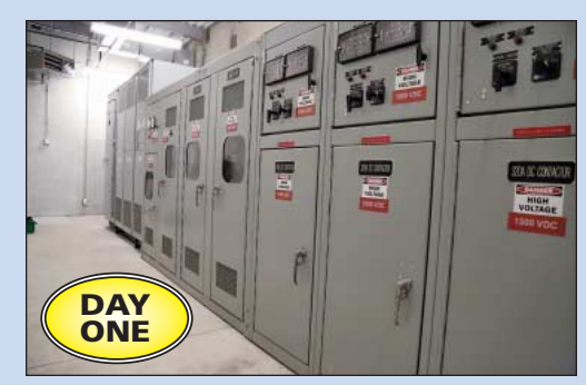
1,500 DC Volt SMC Model SWG-0711-001-A Electric