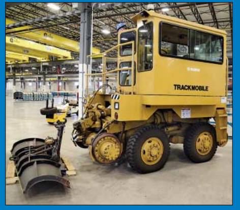
Trackmobile Model 9TM Rail Car Mover