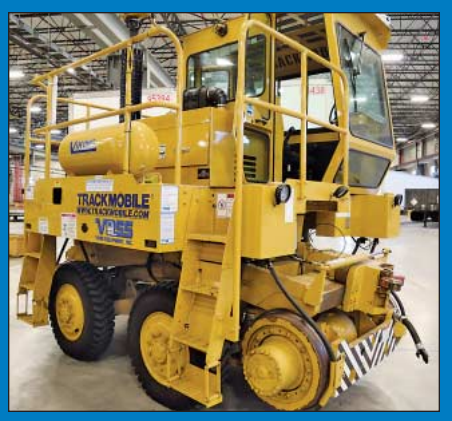
Trackmobile Model Viking Railcar Mover