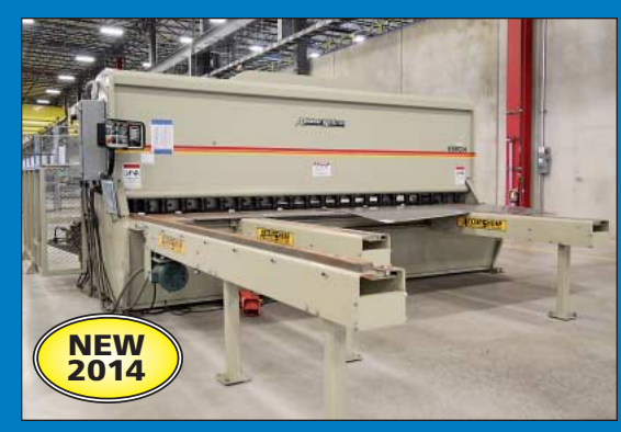
1/2" x 14' AccurShear Model 650014 CNC Hydraulic Shear