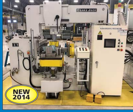
1,500 KN Osaka Jack Model OJ-T-51-4271B CNC Vertical and Horizontal Multi-Ram Hydraulic Press

Haas VF-4 CNC Vertical Machining Center; s/n 18082 (1999) 52" x 18" T-Slotted Table, 50" X-Axis Travel, 20" Y-Axis Travel, 25" Z-Axis Travel, 20 HP Motor, 7,500 RPM, 20 Position Tool Changer, 40 Taper