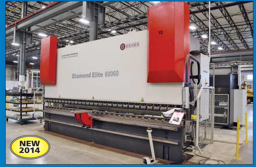
660 Ton X 238" Dener Model DE600-60-AC-ZL-2M Multi-Axis CNC Press Brake

Large Quantity of New Wilson Press Brake Tooling; Including Various Size Gooseneck, Punch, Top and Bottom Dies, Radius, Punch Tip Holders and