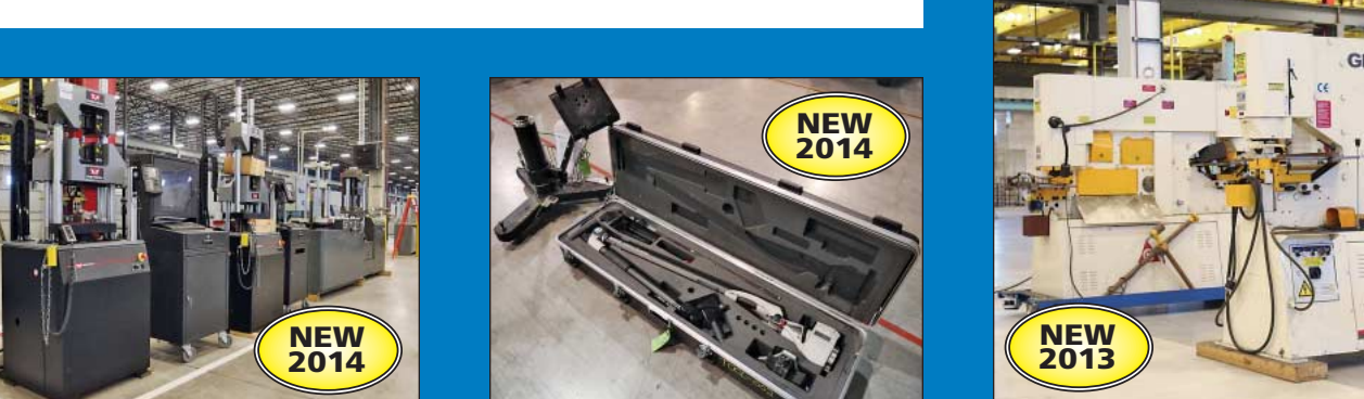
(2) 88 Ton Geka Model 80AD Hydraulic Ironworkers