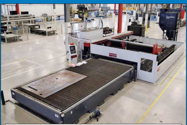
4,500 Watt Mitsubishi Model ML6030XL-45CFR CNC C02 Flying Optic

State-of-the-Art Equipment (Majority Purchased New from 2010 to 2016)