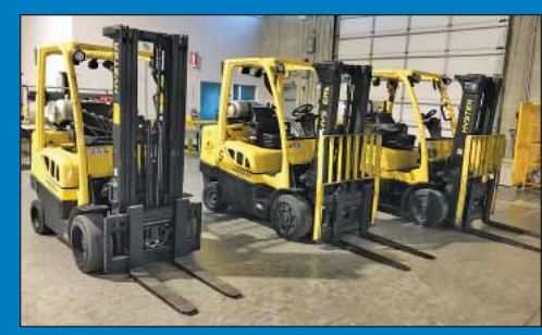
(10) Various Style Late Model Forklifts