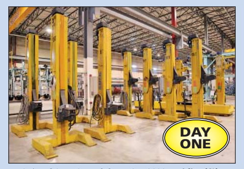
(3) Sets of SEFAC Model M150BF2800 Mobile Lifting Jacks