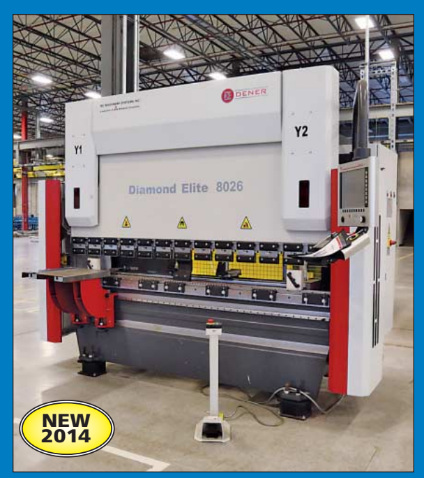
(2) 88 Ton X 102" Dener Model DE80-26-AC-ZL-2M Multi-Axis CNC Press Brakes