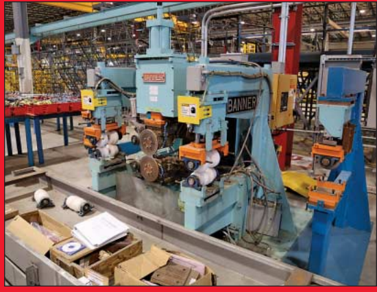
300-KVA Banner Model 2CPS-300-A36 Circular Resistance Seam Welder