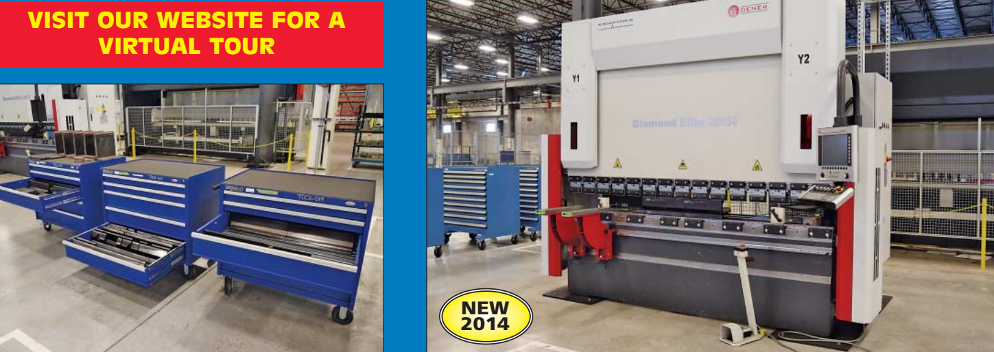
220 Ton X 119" Dener Model DE200-30-AC-ZL-2M Multi-Axis CNC Press Brake