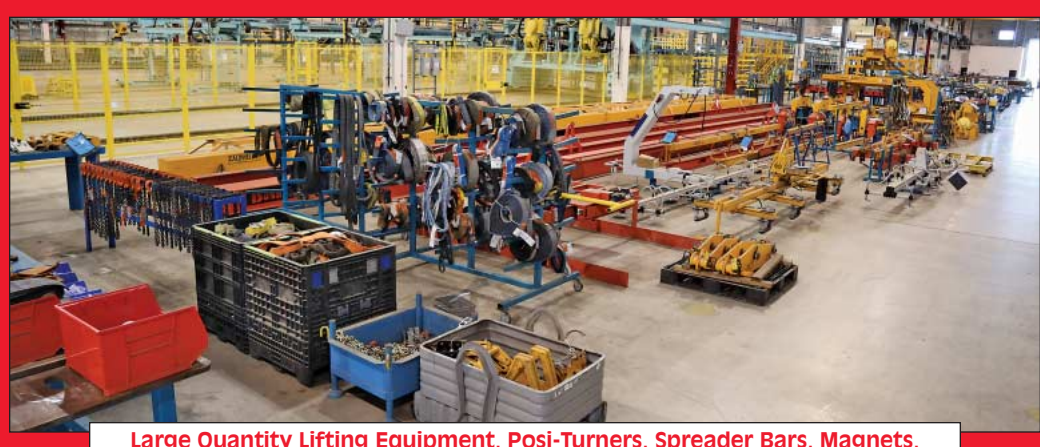
Large Quantity Lifting Equipment, Posi-Turners, Spreader Bars, Magnets, Chains, and Related