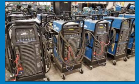
(45) Miller Dynasty 350 Tig Welders