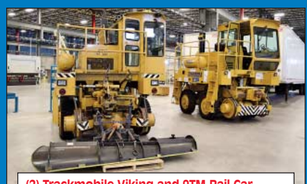
(2) Trackmobile Viking and 9TM Rail Car