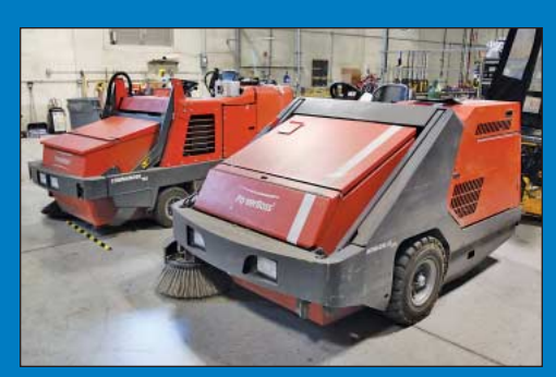
Power Boss Sweeper and Scrubber

State of the Art Equipment (Majority Purchased New from 2010 to 2016)