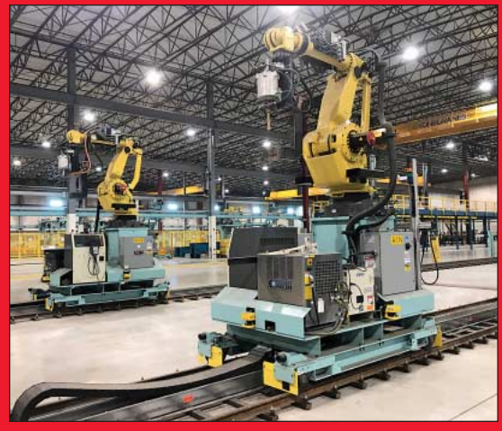
(2) Genesis / Fanuc Track-Traveling Single-Robot Spot Welding Systems