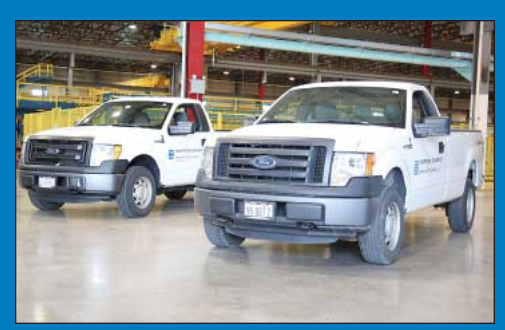
(2) Ford F-150 Pick Up Trucks