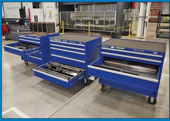
Large Quantity of New Wilson Press Brake Tooling