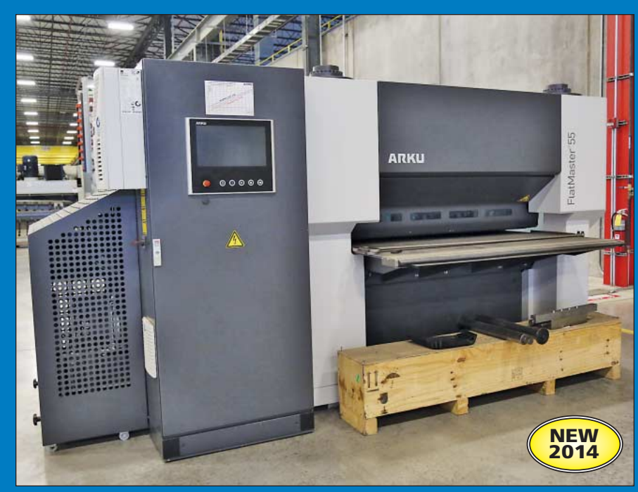
ARKU Model FlatMaster 55165/19 CNC Precision Parts Leveler