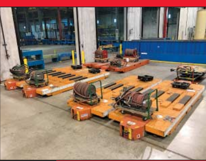
(2) Sets Airfloat Model D36-0041 Platform Transporters

Wire & Metal Two-Sided Modular Catwalk Platform; 17' Deck Height, 16' Clear Height