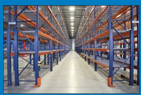
(78) Sections of 9' W x 42" Deep x 26' H Tear-Drop Adjustable Beam Pallet Rack

15% ONSITE BUYERS PREMIUM 18% ONLINE BUYERS PREMIUM