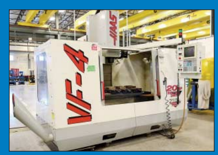
Haas VF-4 CNC Vertical Machining Center