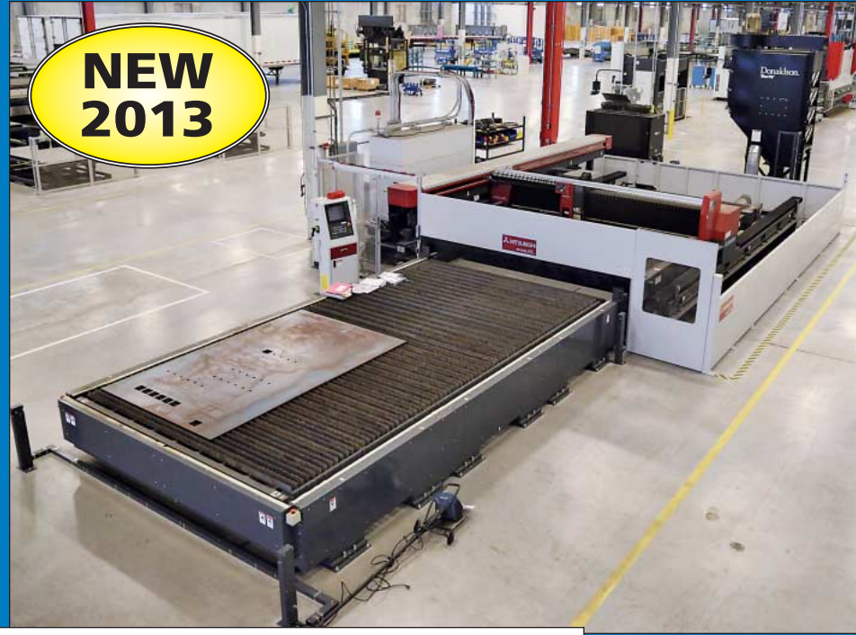
4,500 Watt Mitsubishi Model ML6030XL-45CFR CNC C02 Flying Optic Laser