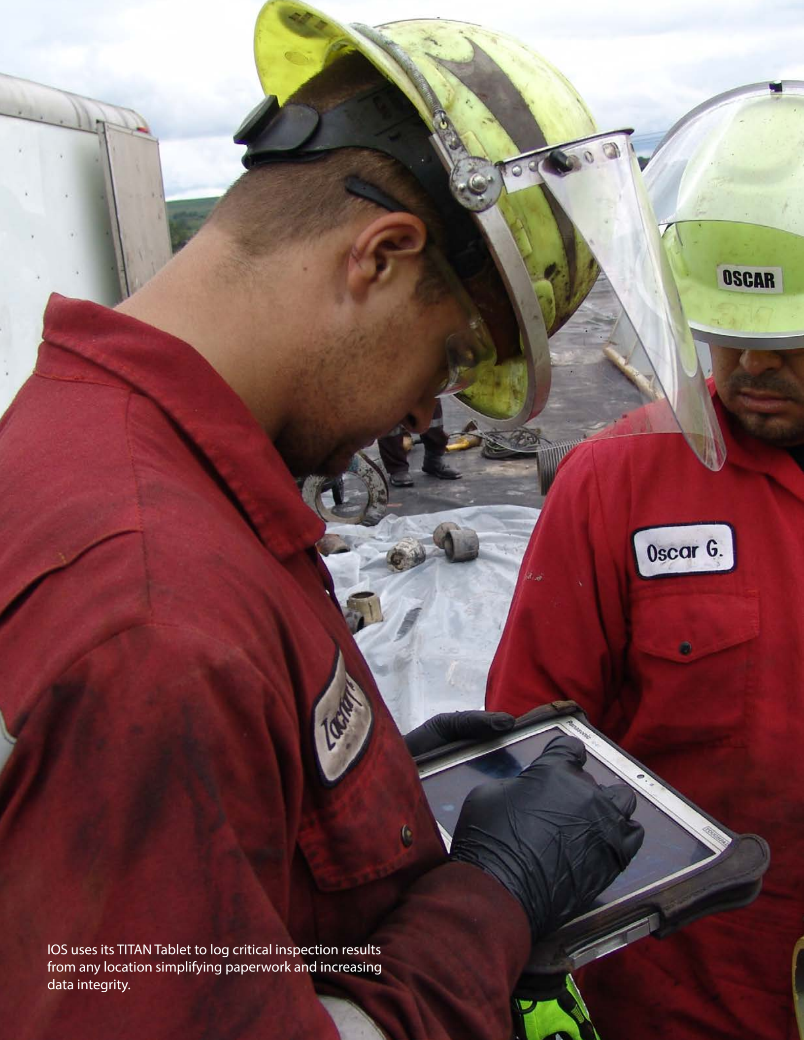
IOS uses its TITAN Tablet to log critical inspection results from any location simplifying paperwork and increasing data integrity.