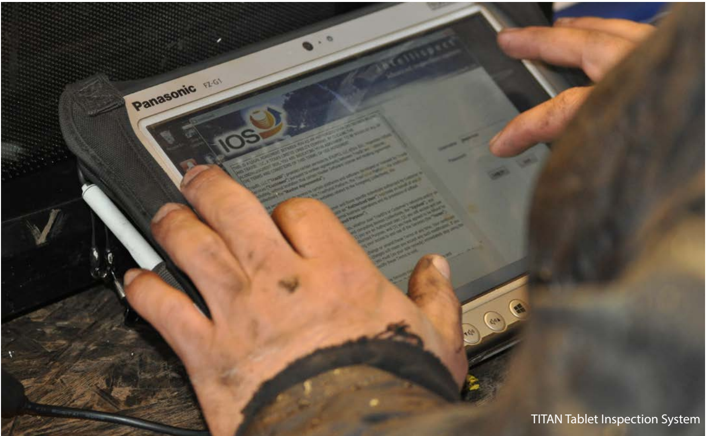
TITAN Tablet Inspection System