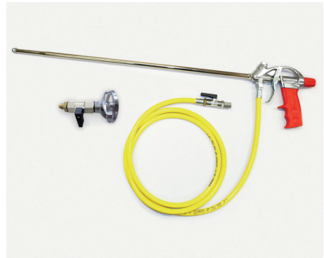
Gun & Hose kit