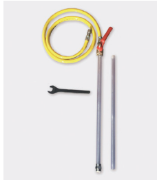
Wand & Hose Kit

NOTE: INSTA-STIK can also be applied on to the insulation board. Where possible beads should run across the width of the insulation boards rather than the length.