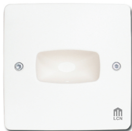
transponder reader LCN-ULT

LCN-ULT, master card, -IV, -NU16 (power supply), Torx-Bit TX-10 & 2 pcs. screws (3,0 x 20 mm)