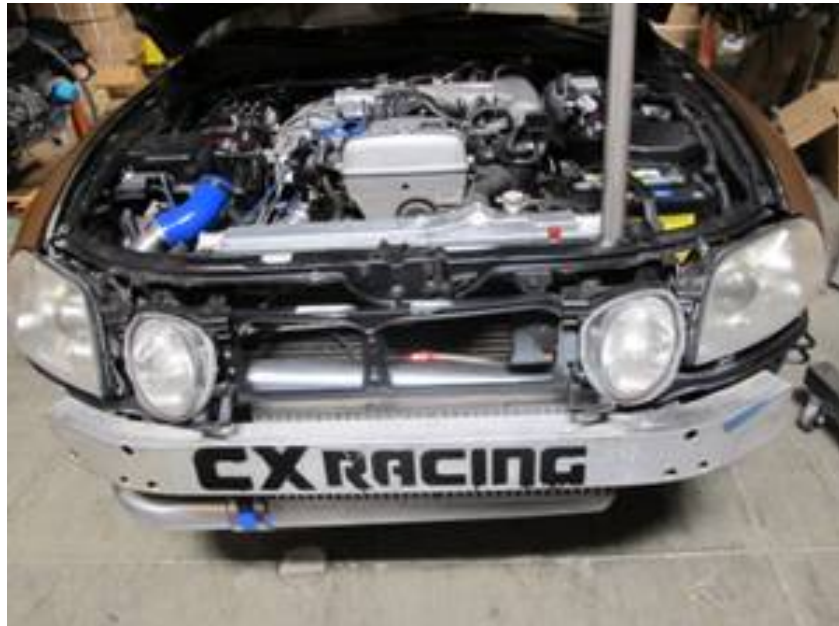
Left and right Intercooler mounting bracket: