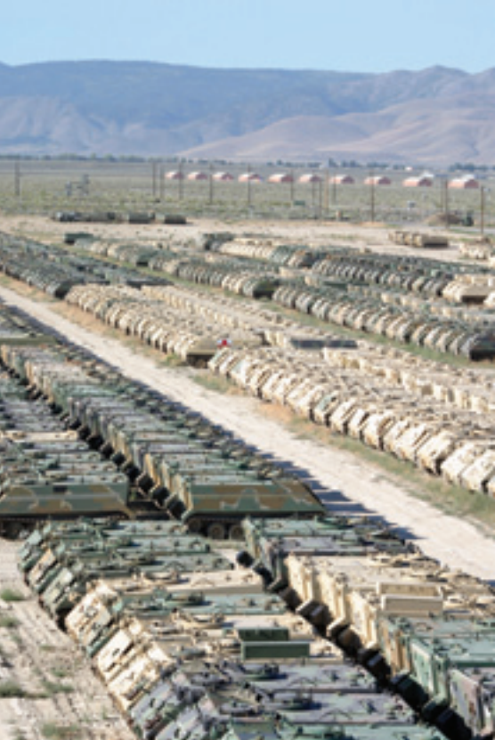
Sierra Army Depot

Antonio, 28,000 acres at subinstallation Camp Bullis, 35 miles northwest. DSN: 471-1211; (210) 221-1211. (Fort Sam Houston will join with Randolph and Lackland Air Force Bases to form Joint Base San Antonio.)