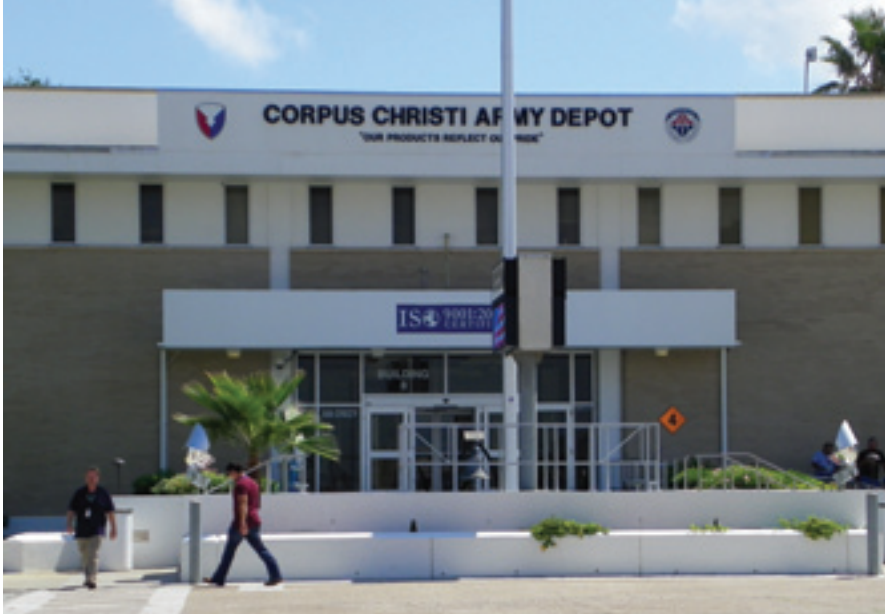
Corpus Christi Army Depot

named for BG William B. Campbell, a Tennessee hero of the Mexican War and governor of Tennessee; home of 101st Abn. Div. (Air Assault); 5th Spc. Forces Grp. (Abn.); 160th Spc. Ops. Aviation Rgt. (Abn.); 52nd Ordnance Group; 30,865 mil., 4,569 civ.; 105,068 acres, 15 miles south of Hopkinsville, Ky., 10 miles northwest of downtown Clarksville, Tenn., and 50 miles northwest of Nashville. DSN: 635-1110; (270) 798-3025.