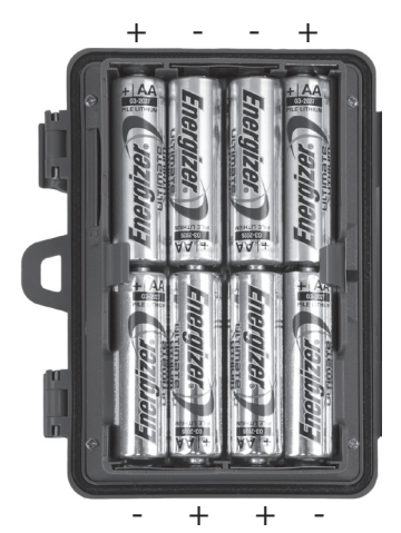
Battery Compartment (note orientation for correct polarity)