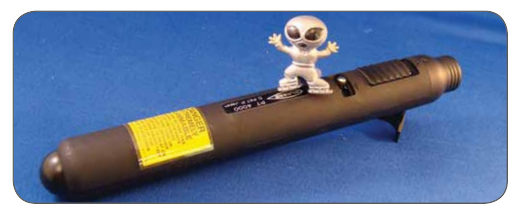
Micro Pencil Torch