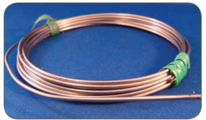
T/C Wire Prandtl Tube