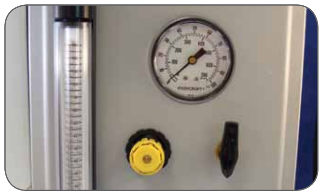
Safety Supplies Test Box