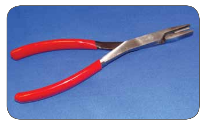
Aeroshim ribbon — regular