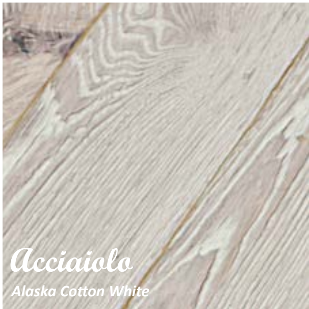
Acciaiolo Alaska Cotton White