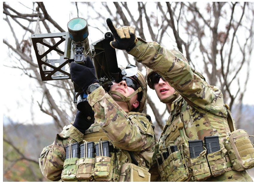
Soldiers with 2nd Squadron, 13th Cavalry Regiment, 3rd Armored Brigade Combat Team (Rotational), conduct hands-on training with the FIM-92 Stinger, a man-portable air defense system, to enhance readiness, 14 March 2019. The 2nd Infantry Division/ROK-U.S. Combined Division hosted a mobile training team from U.S. Army Air Defense Artillery School to certify designated teams on proper use of the Stinger air defense missile.

As an integrated platform, IBCS must prioritize cyber security. Partner nations using unreliable networks (such as those utilizing Huawei components) could jeopardize AMD interoperability. To this end, the AMD CFT is partnering with the Army Artificial Intelligence Task Force to develop software to enhance cybersecurity, data-sharing, targeting and deconfliction.