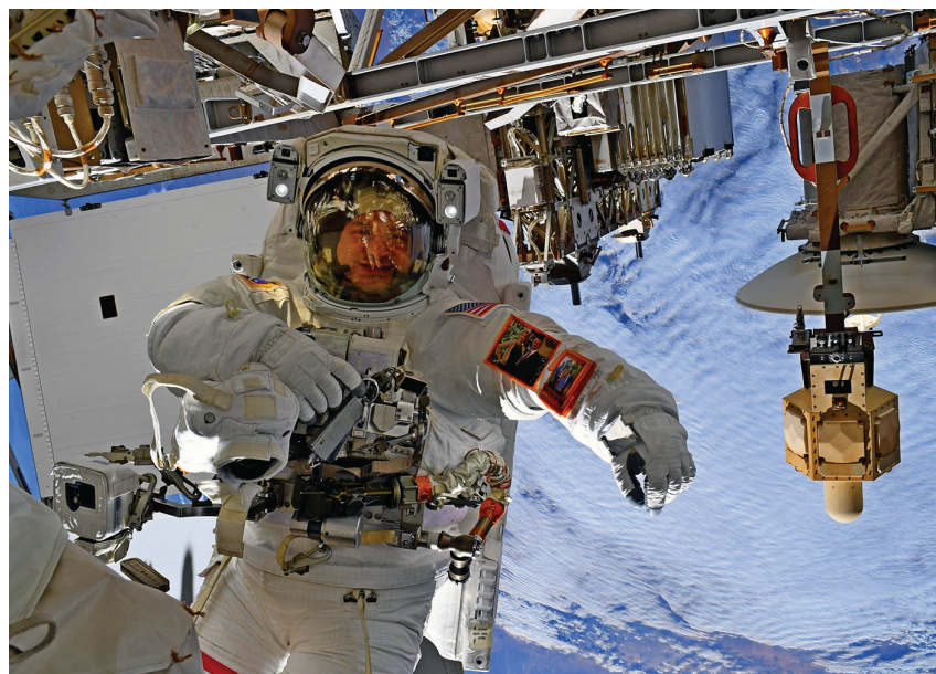
NASA astronaut U.S. Army Colonel Andrew Morgan shows photos of his wife and children attached to his space suit during an extravehicular activity (EVA) space walk to repair the International Space Station's Alpha Magnetic Spectrometer, 20 January 2020. Morgan conducted the repairs with European Space Agency astronaut Luca Parmitano. This EVA marked the ninth for Expedition 61 and Morgan's seventh, setting an all-time record for U.S. astronauts for a single spaceflight. Morgan is the commander of the U.S. Army Space and Missile Defense Command's Army astronaut detachment at Johnson Space Center, Texas (NASA photo by Ronald Bailey).

The optimal platform to intercept a fast, long-range and maneuverable incoming threat can change rapidly. Optimized interception requires moving toward an "integrated joint kill web." 10 Current Army C2 only leverages its own sensors and fires.