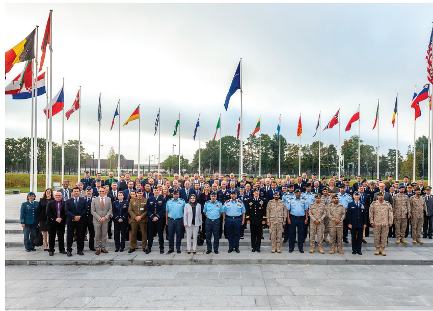
Senior leaders from 23 nations and three international organizations gathered at the NATO headquarters in Brussels, Belgium, 12–13 September 2018, to collaborate on the Nimble Titan 18 IAMD exercise.

To defeat these strategies, the Army developed the MDO concept to compete, to penetrate enemy anti-access/area denial (A2/AD) and to create favorable conditions for the future. IAMD will protect U.S. and partnered assets and forces throughout the battlespace—from the strategic support area through the operational support, tactical support, close and deep maneuver areas—as the joint force conducts joint all-domain operations, i.e., JADO.