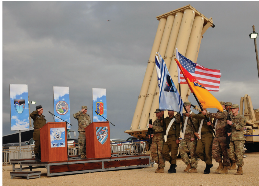
A combined U.S. and Israeli color guard presents the colors during a closing ceremony for the Terminal High-Altitude Area Defense (THAAD) system deployment to Israel, 25 March 2019. The ceremony concluded a first ever deployment of a THAAD battery, along with other supporting troops and equipment, to Israel under DoD's Dynamic Force Employment concept (U.S. Army photo by Captain Aaron Smith).

The U.S. Space Force requested 2.48 billion dollars in Fiscal Year (FY) 2021 for a next-generation, space-based overhead persistent infrared system, designed to counter adversary advances in missile technology. The MDA is pursuing layered homeland defense and improvements to regional