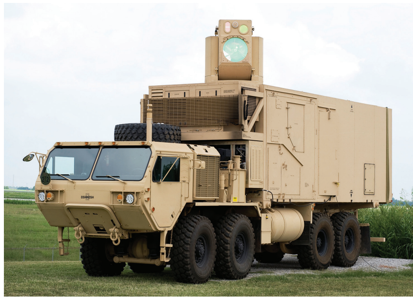
Despite challenges, Army Science and Technology Reinvention Laboratories are making significant strides—including work by the U.S. Army Space and Strategic Defense Command/Army Forces Strategic Command—to advance high-energy laser weapons, like this one. They have the potential to be an effective, low-cost complement to kinetic energy to address threats from rockets, artillery and mortars, as well as from cruise missiles and unmanned aerial systems.

Combining space-based sensors and directed energy interceptors can revolutionize defense against hypersonic missiles and other aerial threats. Interceptors must fly three times faster than their targets; lasers move at the speed of light. Industry needs to reduce size and power requirements for energy output.