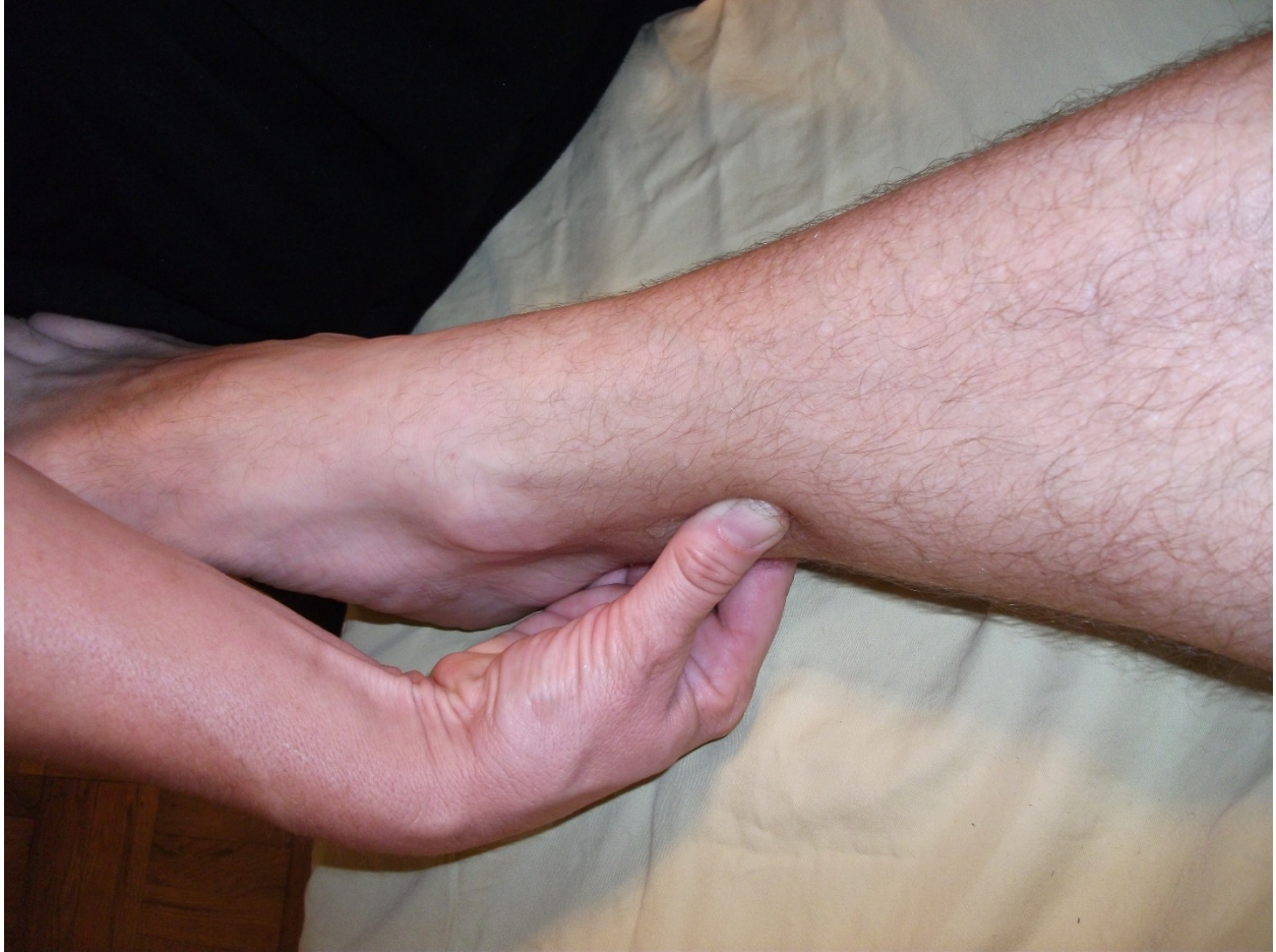
Picture 3: Golden Point, Spleen 6 where the liver, spleen and kidney channels cross. Calms the mind , increases circulation and energy, regulates metabolism .

One only has to read Hans Selye's research on the effects of stress on the human body and mind.