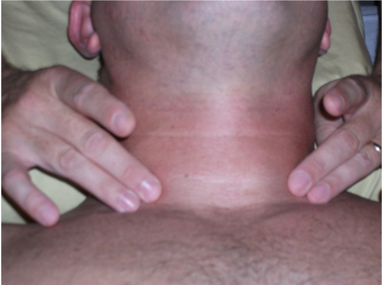
Picture 6: Lymphatic massage with essential oils towards the two thoracic ducts

If premixed with a carrier oil, then the therapist again applies the mixture lightly with long stripping strokes starting proximally to the major lymph nodes and then working distally