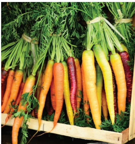
If you could purchase a bunch of "IPM certified" carrots, would you?

could be easily adopted and widely used, even in conventionally-grown crops. The small share of revenue in organic and IPM production is not a fair measure of success. Knowledge cannot be bought or sold, like a jug of chemicals or a bag of compost. Farmers—whether organic, IPM, or conventional—who apply excessive inputs are seldom held accountable. However, corporate sustainability efforts are increasing pressure on all growers to improve.