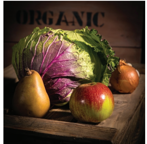
Still life with organic fruit and vegetables.

There are commonalities to organic, IPM, and even conventional farming. Organic producers practice IPM, for example, by using cultural, biological, and in some cases chemical controls. Some ecologically-based growing practices are becoming more common in conventional farming, including cover crops and reduced tillage systems. Organic food has broad consumer awareness and support, price premiums, and a clear set of standards through the National Organic Program (NOP).