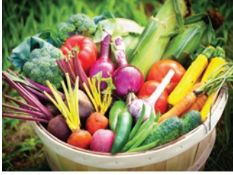
Organic and IPM, working together, a win/win.

A s a discipline, agriculture has a need for resources to support research, education, Extension, and technology transfer. Within the field of crop production and protection, IPM and organic are no different. Yet, their basic philosophy—which places an emphasis on the environment, human health, and profitability—sets them apart from other approaches.