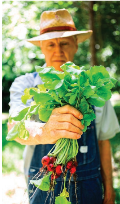
What are the challenges for a farmer with radishes?

The same cannot be said for marketing “IPM-grown,” which is hindered by low consumer awareness and appreciation. With federal regulation of the organic label, and the marketing and education campaigns that accompanied it, came a surge in demand for organic products in the marketplace, along with greater legitimacy for organic methods within the agricultural research and Extension establishment. Global sales of organic in 2012 were approximately US$63.8 billion. Despite all the growth, organic remains a tiny fraction of world and US agricultural production. The US has a total of 844 million acres (342 million Ha) of land in agricultural production, with 0.6% of it organic. Depending on your viewpoint, the glass is either half full or half empty.