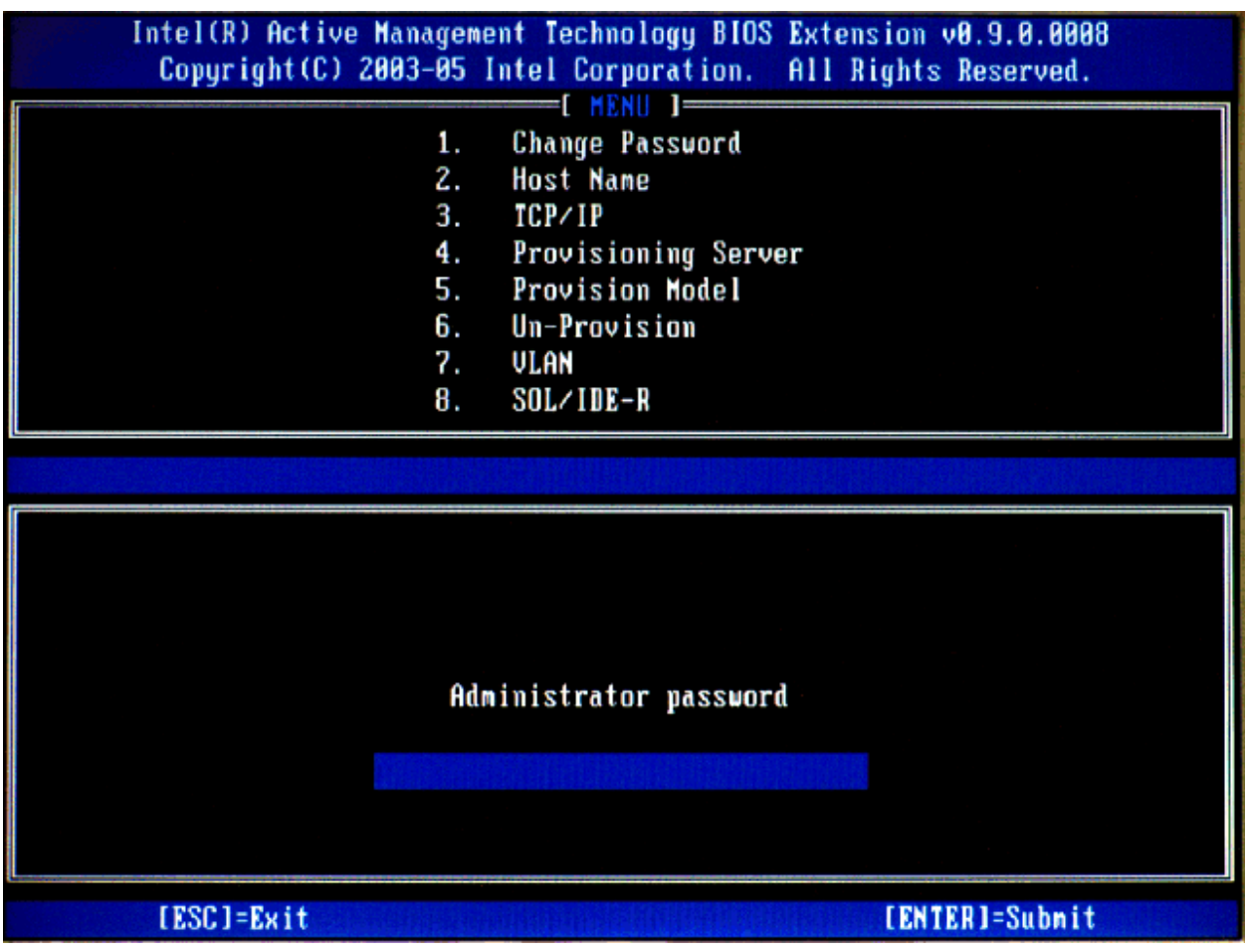
Figure 1. Intel AMT BIOS Extension Menu

1. Power on the computer and press CTRL-P when prompted. This displays the Intel AMT BIOS Extension Menu.