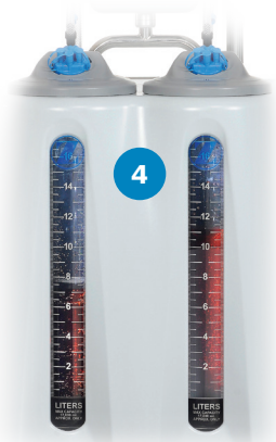
Reservoir windows with lights on/tint off