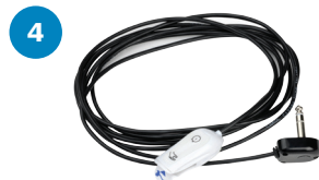
Automatic Activation Device AAD01