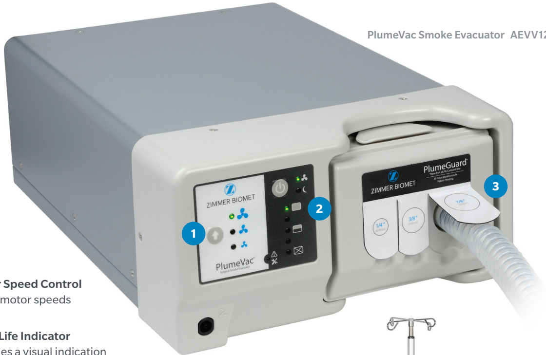
PlumeVac Smoke Evacuator AEVV120

The portable PlumeVac Smoke Evacuator gives you the flexibility to put smoke plume evacuation where you need it – on or off the cart.