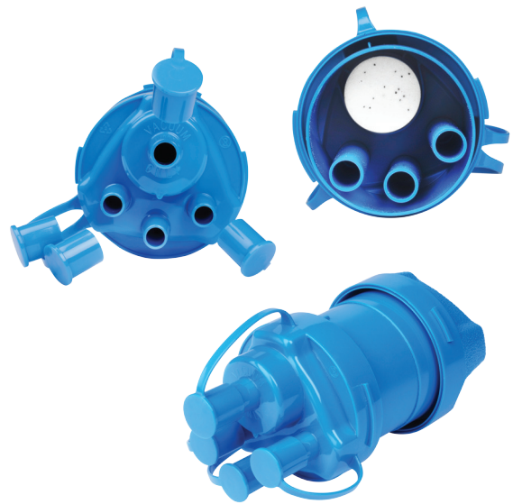
Single Use Manifold 00514020100