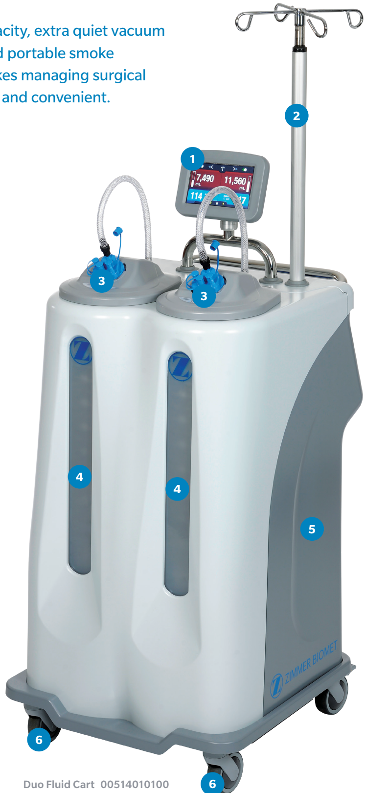
Duo Fluid Cart 00514010100