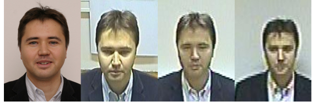
(b) SCface database: enrolment/mugshot image; test images from close, medium and far distances.