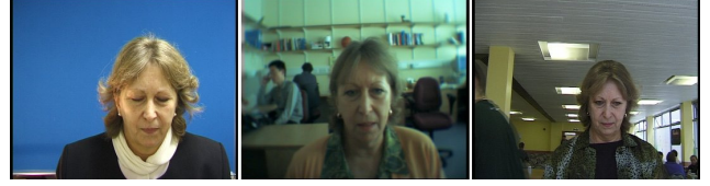
(a) BANCA database: controlled, degraded, and adverse scenarios.

Results are reported for the Pooled test (P) on the English subset of the BANCA database [3]. While BANCA is actually a multi-modal database of videos, we used the 5 pre-selected still images from each video and treated each image independently, as specified in the protocol. Images were captured in three different scenarios, referred to as