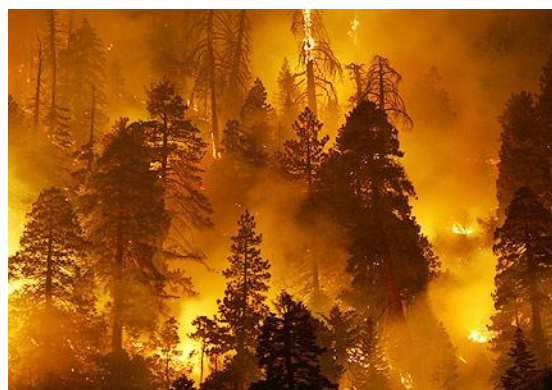
The Fire of Jeremiah

God promises a judgement by fire in the End Times. “ And I will send a fire on Magog, and among them that dwell carelessly in the isles: and they shall know that I am the LORD ” Ezekiel 39:6.