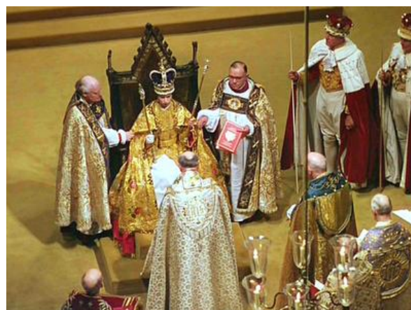
The Queen Enthroned with “The Royal Law”