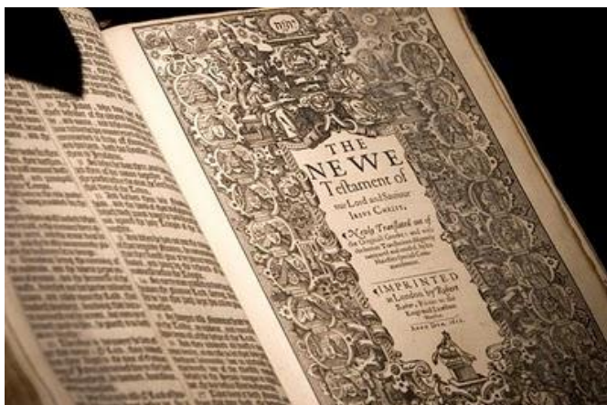
“The Royal Law” James 2:8