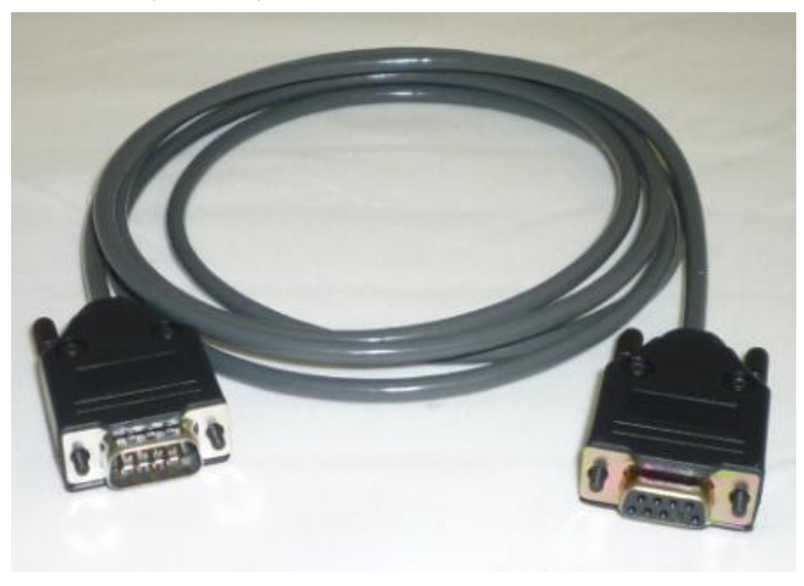
Part ME560033 - GE B105, B125, B40 Patient Monitor

Data Cable - DB9 Male to DB9 Female (6' length)