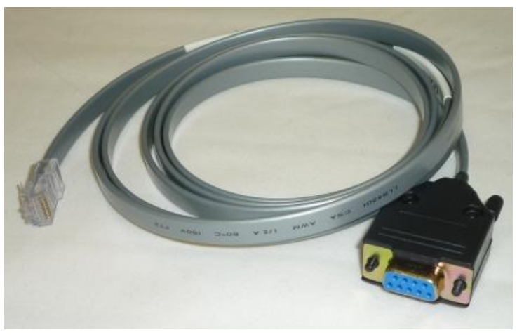
Part ME560036 - Data Cable GE Dash 3000/4000/5000 Data Cable - RJ45 male to DB9 Female, (9' length)