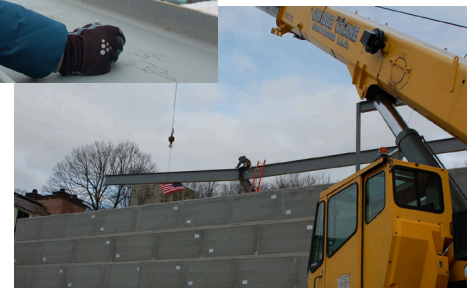
Topping off the final beam to the Education Center.