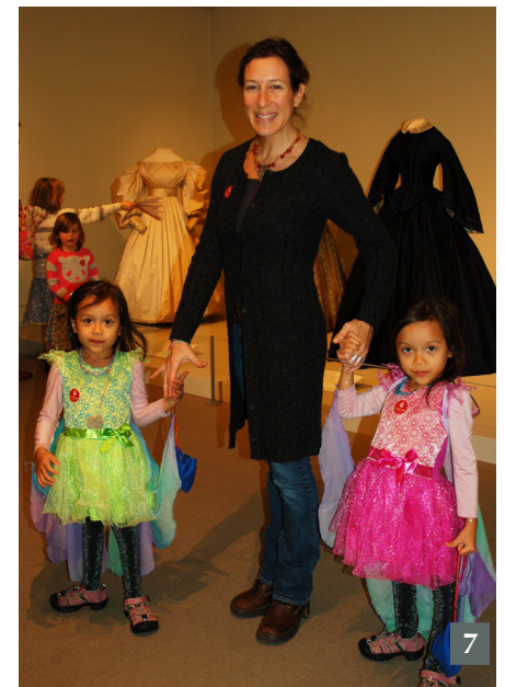
5-7. Fresh Goods Kids' Opening Costume Party Costumes, crafts, and games.