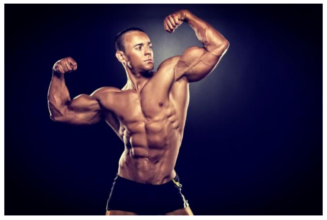
Intermittent fasting can get you ripped.