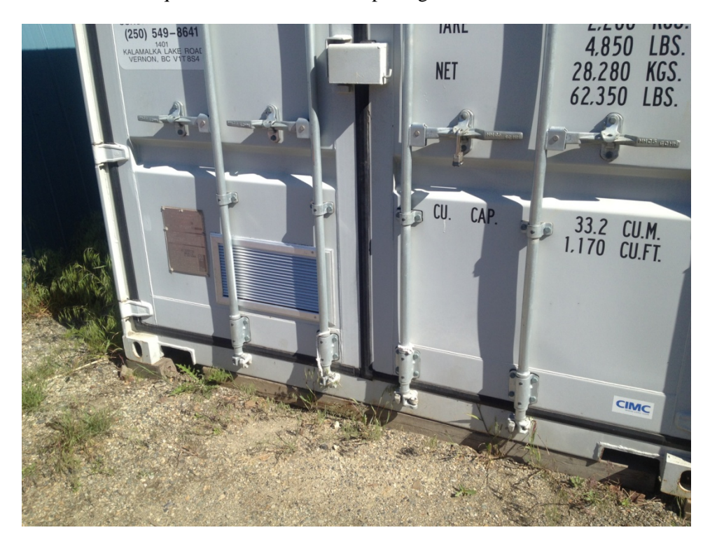
Suggested upper ventilation opening and wind vent

Required lower ventilation opening in container door