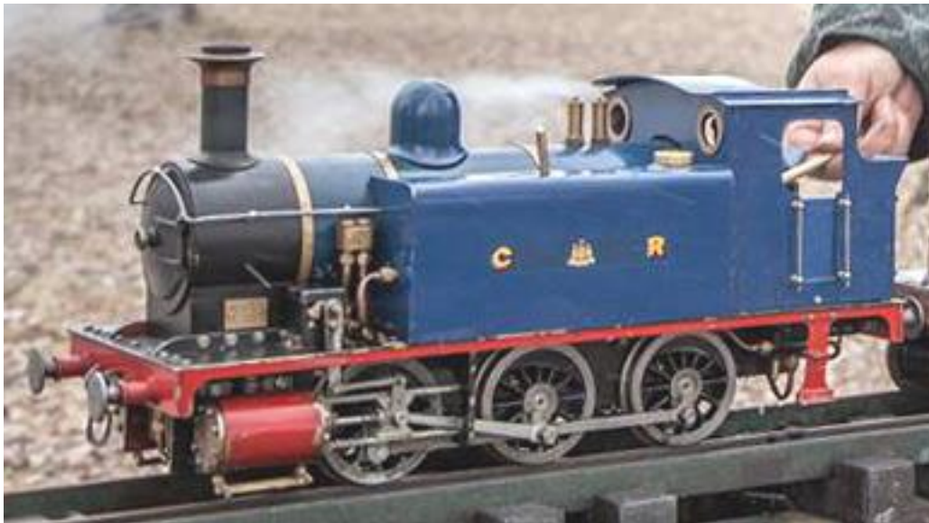
Photo taken at Montreal LS track, 1 January 2015.