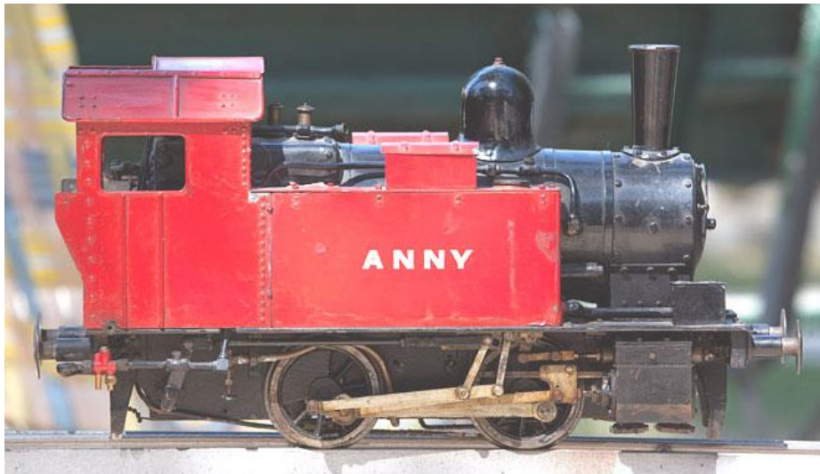
Photo taken at Los Angeles LS, 25 June 2011. Loco still unrestored at that time.