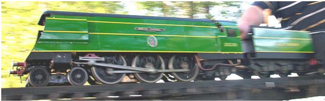
Photo taken on inaugural run, 1 July 2011 at Montreal LS. Prototype is in the British national rail museum in York, numbered 34051. Loco used on Winston Churchill's funeral train in January 1965. This loco may be three-cylindered (the prototype is).