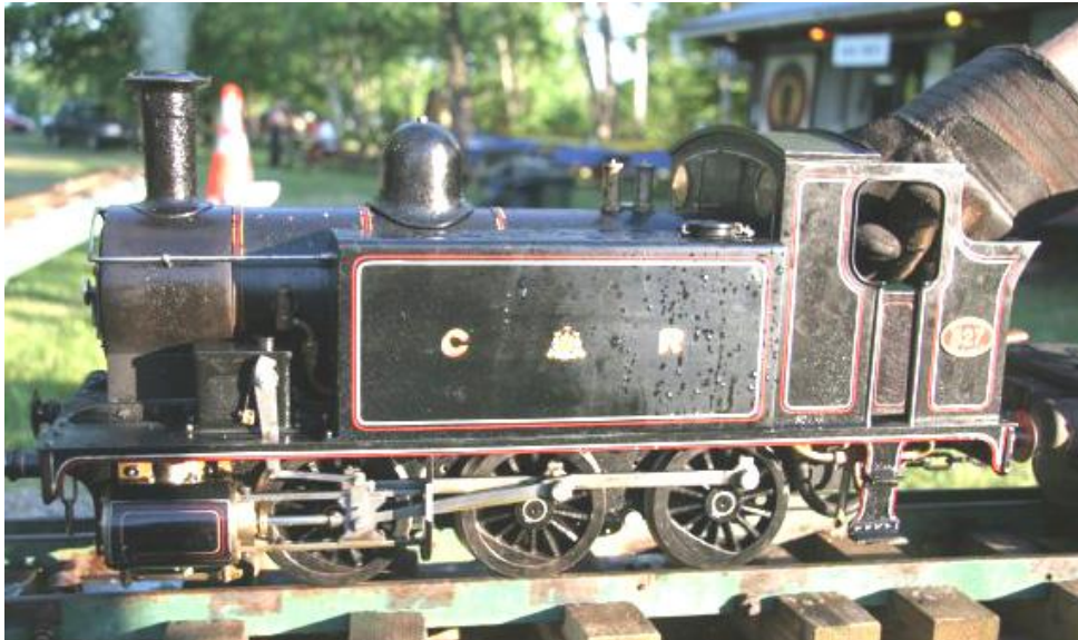
Photo taken at Montreal LS, 2008.