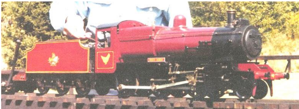
Photo of loco freshly-painted at N. Beverly MA, 1979