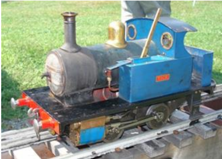
Photo at Pioneer Valley LS, Southwick MS, 2012