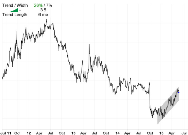
Sumitomo Corp (8053 JP) vs MSCI AC World ex USA Value Net USD