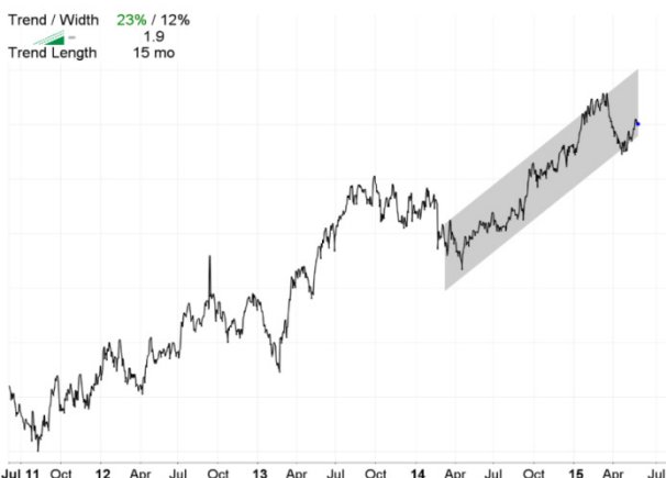
BAE Systems (BA. LN) vs MSCI AC World ex USA Value Net USD