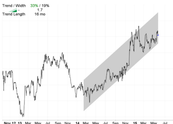
Japan Airlines (9201 JP) vs MSCI AC World ex USA Value Net USD