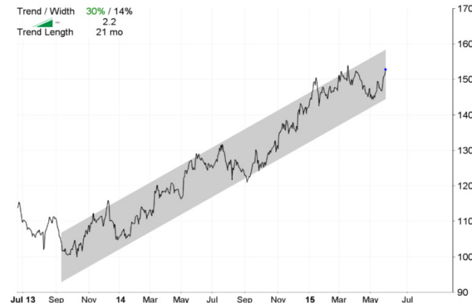
bpost SA (BPOST BB) vs MSCI AC World ex USA Value Net USD