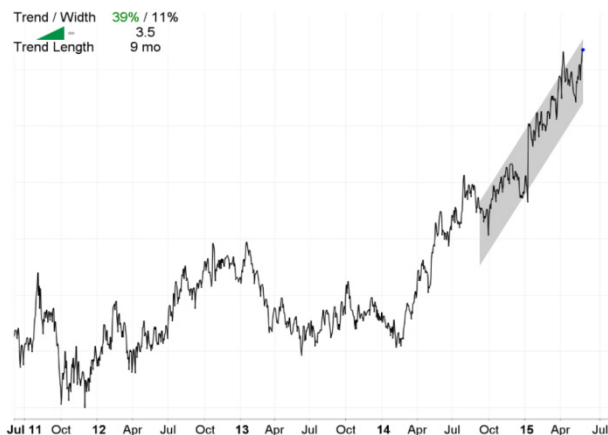
Cheung Kong Holdings (1 HK) vs MSCI AC World ex USA Value Net USD