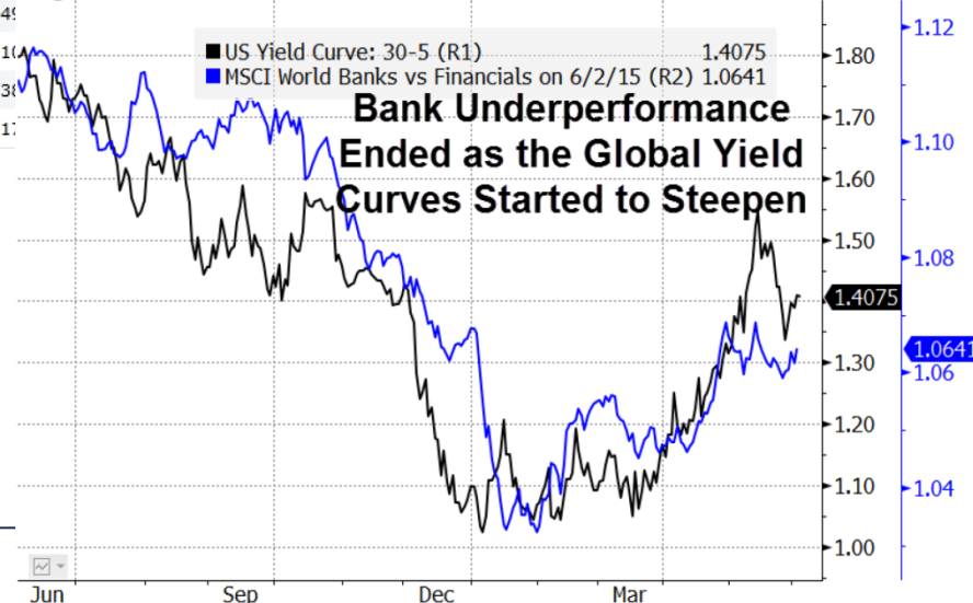
Figure 2: Global Banks vs Financials & US Yield Curve