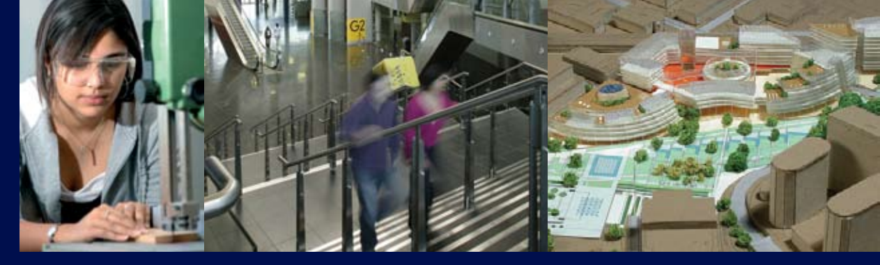
Above: Millennium Point and plans for new campus at Eastside.