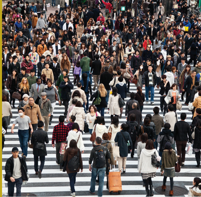
Pedestrians in Tokyo, Japan

Urban and territorial planning can contribute to sustainable development in various ways. It should be closely associated with the three complementary dimensions of sustainable development: social development and inclusion, sustained economic growth and environmental protection and management.