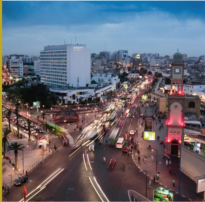
Place of United Nations in Casablanca, Morocco