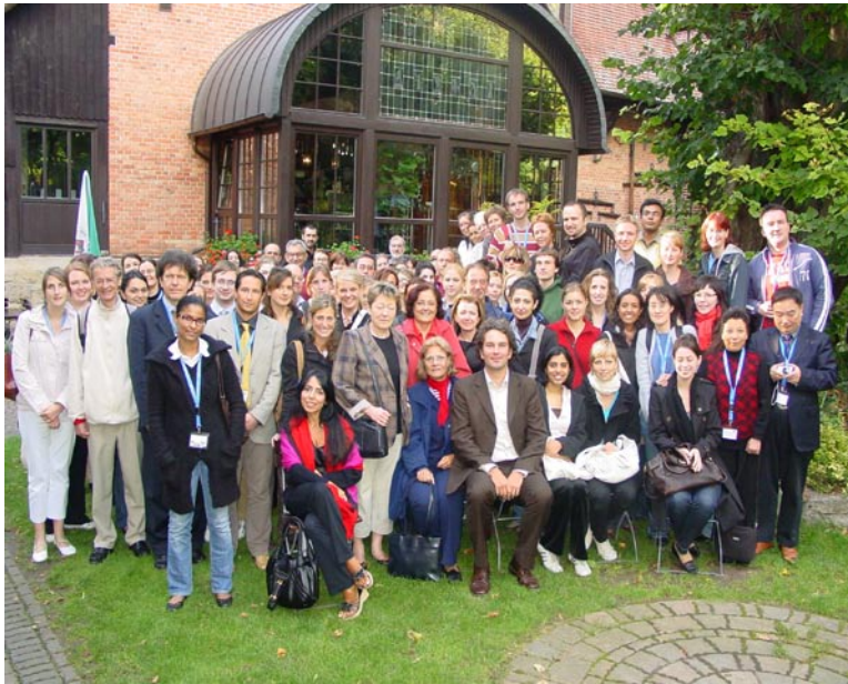
(Almost) all participants in front of a Jena brewery