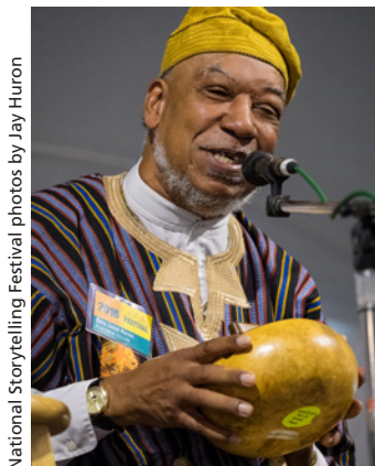
National Storytelling Festival

Storytelling for All will work to proactively involve groups and audiences from African American, Native American, Tribal communities, Asian American, and European American populations. All will be invited to partner with ISC on identifying aspects of the collection that are particularly meaningful to their communities and have potential to foster dialogue and promote community development collaborations. We will actively invite these groups to partner in ways that will enable them to recognize that the heritage in this collection belongs to them and can be used to frame a story for today that speaks to a more equitable society for tomorrow.