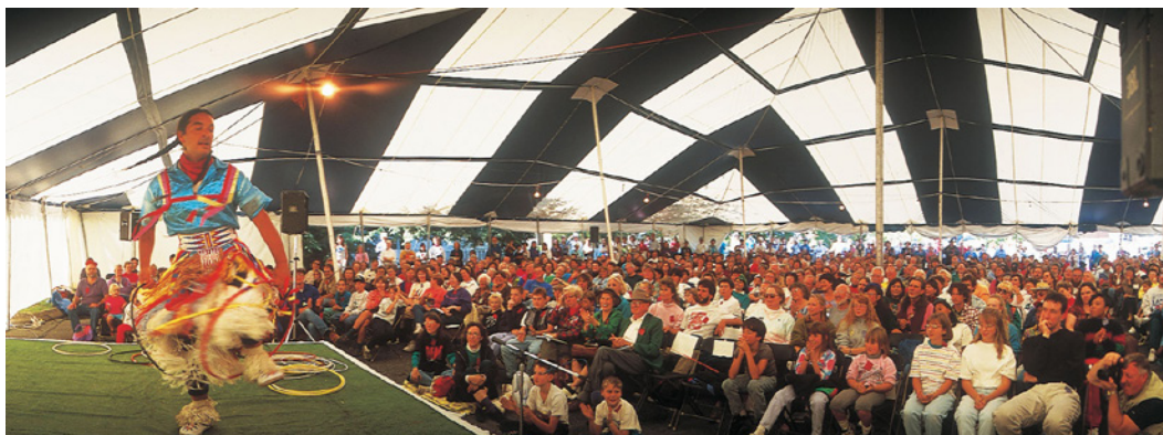
National Storytelling Festival

But during the late 1960s and early 1970s, there emerged throughout America a realization that we were losing our connection to the genuine one-on-one communication. In 1973, in a tiny Tennessee town, something happened that rekindled our national appreciation of the told story and became the spark plug for a major cultural movement — the rebirth of the art of storytelling.