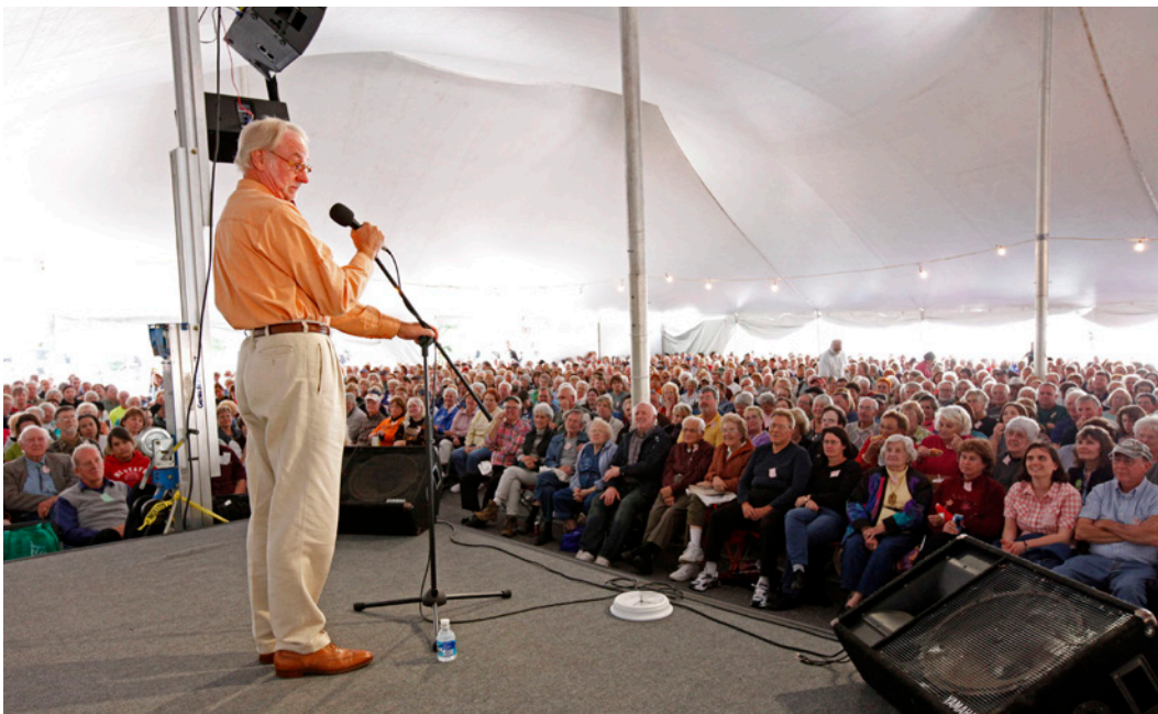
National Storytelling Festival

For almost half a century, the International Storytelling Center (ISC) has been at the forefront of sustaining storytelling as a traditional folk art, promoting innovation and the integration of storytelling across disciplines. ISC serves as a national Learning Resource Center that facilitates efforts to incorporate the art of storytelling in promoting understanding, equity, and justice. We create educational and professional tools, storyteller residencies, world class festivals, disseminate research, evaluative results and curate and share best practices in using the art of storytelling for peace and community-building.