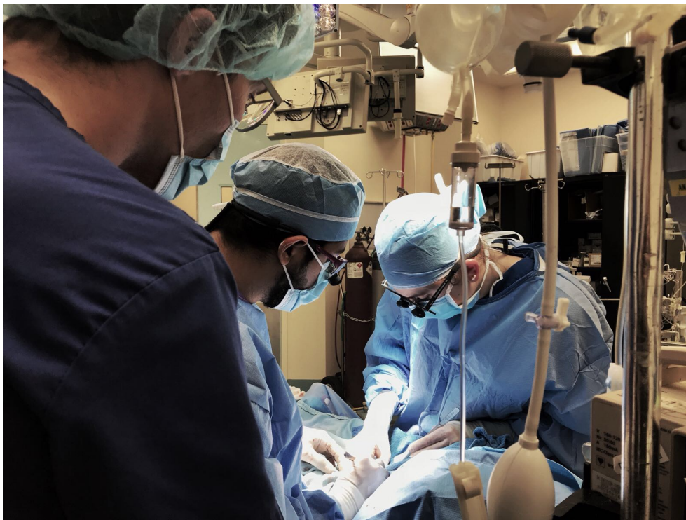
Figure 2. Implantation of a perfused porcine liver into a recipient pig in a fully equipped operating theatre for large animal research.